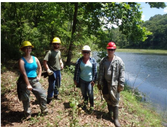
Fig. 1. Student interns treating exotic honeysuckles in Paines Crossing, a Forest Special Area wetland.

In total, over 3,500 acres of NNIS were treated across the Forest and 164,208 acres were aerially surveyed for tree-of-heaven. 2015 will see continued coordinated Ailanthus work with AOWCP and our partners across southeast Ohio.