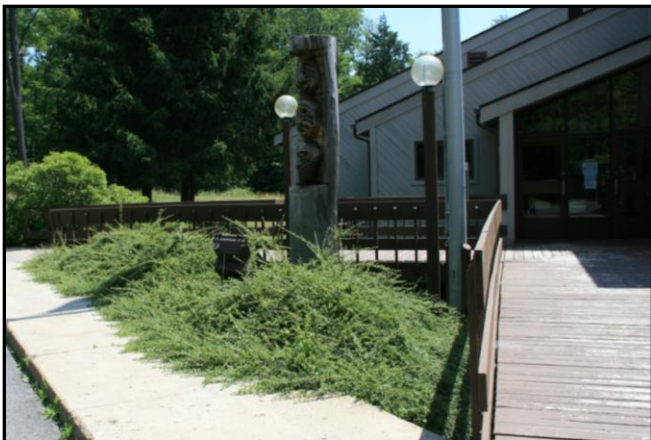
Figure 1. Area in front of office prior to invasive plant removal.

Next steps include creating and installing a “What’s Happening Here Sign”, plant labels, Monarch Waystation signs and interpretive signs in the spring of FY12.