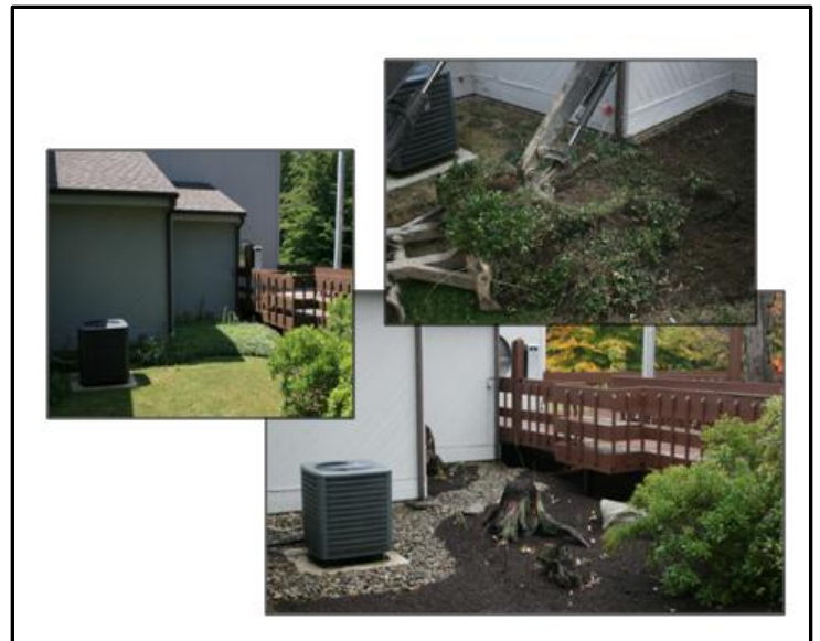
Figure 3. Rain Garden Creation.