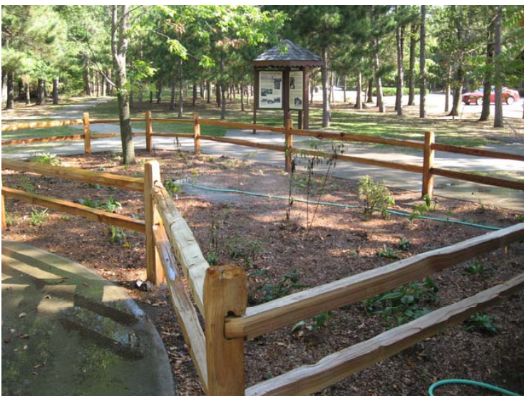
Figure 2: View of first garden near the visitor center.

Contact Person & phone number: Greg Schmidt, 989-326-3252x3319