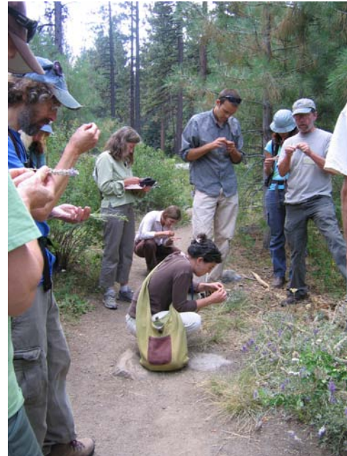
Figure 2. Rancho Santa Ana Botanic Garden Instructor and Forest Service staff examining seeds for seed ripeness during the workshop.

The field portion of the workshop including discussing and examining seed development and maturity in the field and demonstrating different collection methods on a variety of plant species. Participants received a reference notebook of materials.