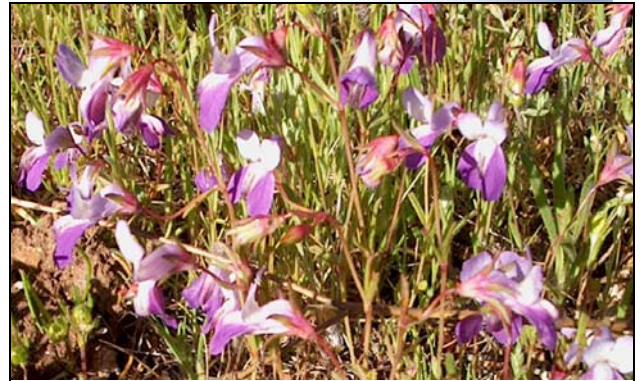
Collinsia sparsiflora plants growing on serpentine soils.

Due to the timing of when funds became available, and the dry weather in FY07, only a limited number of tissue collections were made. Therefore, the project is going to take longer than originally projected. However, we were able to conserve funds this year by minimizing travel costs and using already available lab supplies. This will mean more funds are available for a full field season starting in February 2008.