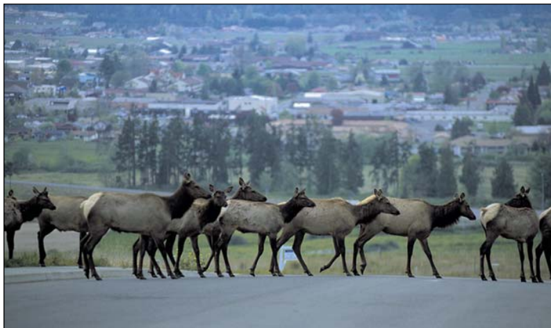
Roosevelt elk crossing a busy road near Sequim, Washington

FUNDED OUTPUTS: A local contractor will collect seed in 2007 and 2008. The contractor will deliver a minimum of 25 lb of fully cleaned seed. The seed will be used for either seed increase (grasses, forbs) or for propagation (shrubs, trees) of native elk forage to be established in the watershed.