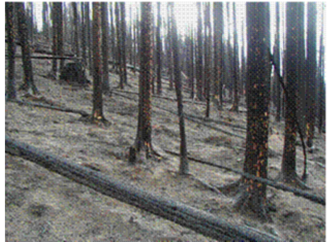
Mt. Leona Fire 2001

Total Native Species Project Cost: $25,000