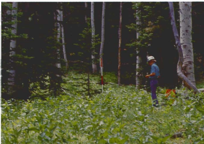
Figure 1.—A seral aspen community in northern Utah rapidly being replaced by Engelmann spruce and subalpine fir climax forest.

The uneven age distribution of aspen trees in some stands (fig. 2) indicates that aspen can be self-perpetuating without necessarily requiring a major rejuvenating disturbance such as fire. Whether such stands qualify as "climax" is unclear. An uneven-aged structure of the aspen overstory, lack of evidence of successional change in the understory, and absence of invasion by trees more shade tolerant than aspen are indicators of community stability. Such relatively stable stands that are able to persist for several centuries without appreciable change should be considered at least de facto climax, and should be managed as stable vegetation types.