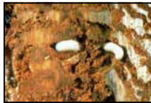
Figure 8. Mountain pine beetle larvae in feeding galleries.