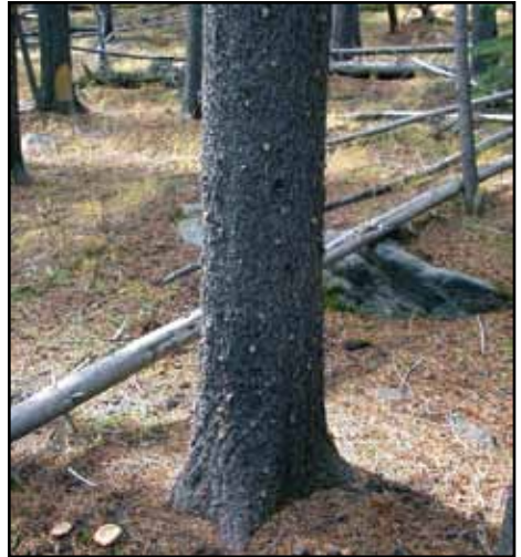
Figure 3: Pitch tubes and boring dust—indicative of a successful mountain pine beetle attack in lodgepole pine.

Needles on successfully infested trees begin changing color several months to a