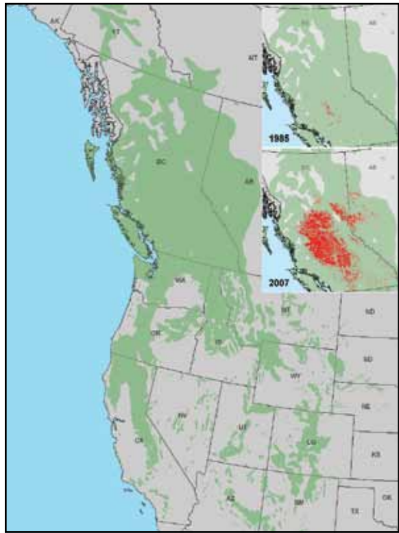
Figure 1. The range of mountain pine beetle generally follows its major host pine species throughout western North America (shown in green). Current range of mountain pine beetle extends from northern Baja California, Mexico and southern Arizona, US to central British Columbia, Canada. In recent years, mountain pine beetle outbreak populations (shown in red) have been found further north into British Columbia and east into Alberta than had been observed in historical records, including an outbreak in 1985.

Major hosts of mountain pine beetle include lodgepole, ponderosa, western white, sugar, limber and whitebark pines. All pine species within in their range, including Coulter, foxtail, pinyon, and bristlecone pines, can also be infested and killed. Scotch and Austrian pines, introduced into North America as ornamentals, Christmas trees and/or forest plantations, are also susceptible to at-