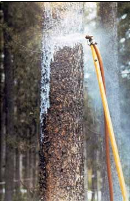
Figure 13. Preventive treatments can successfully protect susceptible hosts from mountain pine beetle attacks.

Synthetically produced pheromones are registered and periodically reviewed by the U.S. Environmental Protection