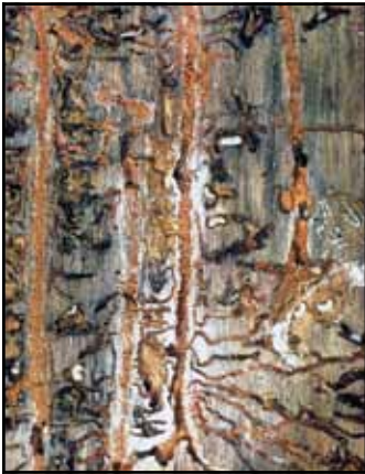
Figure 6. Mountain pine beetle egg and larval galleries.

Larvae are legless white grubs with brown heads that feed in the phloem, constructing galleries that extend at right angles to the egg gallery. Development through four larval stages (instars) is temperature dependent and therefore highly variable from year to year and site to site. The final larval instar excavates an oval cell where pupation occurs and the new adult is formed. New, immature adults spend a period of time maturation feeding on fungal spores and associated tree tissue before emerging. When several feeding chambers coalesce, adults may be found in groups, and one or more beetles often emerge from the same exit hole. Within one or two days of emerging, adults seek out and attack new trees, to resume the yearly cycle (Figures 8, 9, 10).