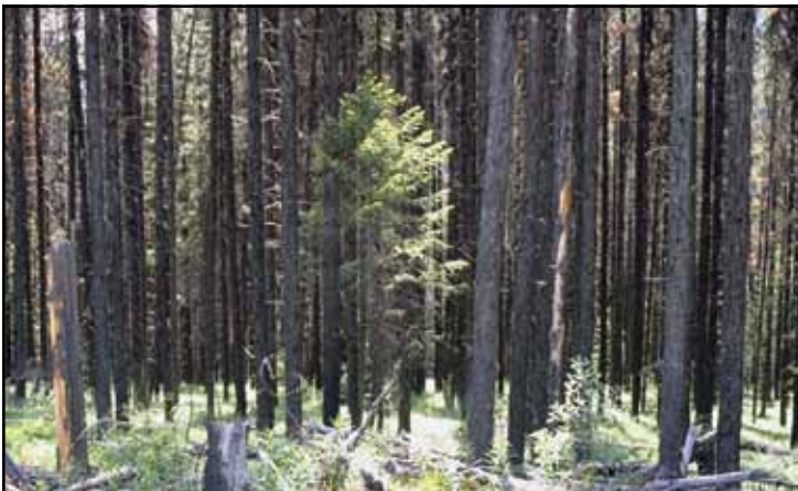
Figure 12. A “high-hazard” lodgepole pine stand, very susceptible to mountain pine beetle infestation.

Insecticides. Preventive treatments, applied before trees are infested by beetles, are an