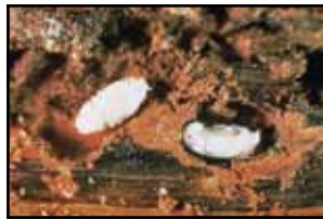
Figure 9. Larvae transform to pupae within cells constructed at end of feeding gallery.