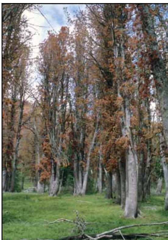
Mountain pine beetle-killed whitebark pine in Yellowstone National Park, 2004.

Mountain pine beetles can reproduce in all species of pine within their range. Outbreaks often develop in dense stands of large-diameter (>8 inches), older (>80 years-old) lodgepole pine and dense stands of mid-sized (8-12 inches diameter) ponderosa pine. When weather is favorable for several consecutive years, severe outbreaks can occur in high-elevation stands of whitebark and limber pine. Widespread outbreaks develop over several years and can result in millions of dead trees. Periodic losses of high-value, mature sugar and western white pine are less widespread, but also serious.