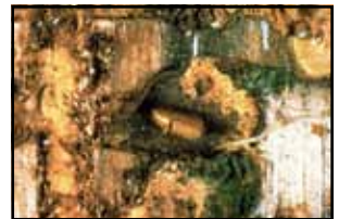
Figure 10. "Callow" or immature adults darken before emerging to complete life cycle.