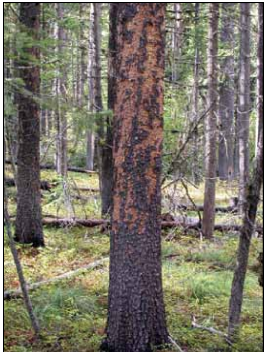
Figure 11. Woodpecker feeding on overwintering larvae typically has little effect on outbreak populations.

Competition. Mountain pine beetle larvae compete for food and space not only with each other, but with larvae of other insect species. For example, larvae of