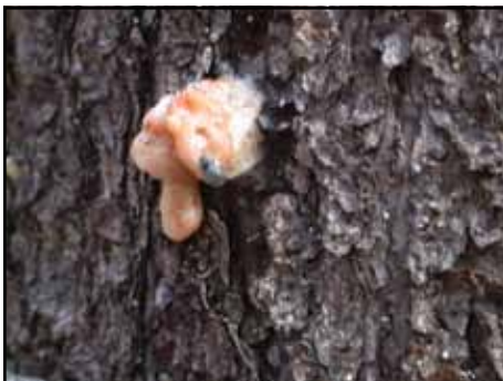
Figure 2: Unsuccessful mountain pine beetle attack—commonly called a “pitchout.”

In addition to pitch tubes, successfully infested trees will have dry, reddish-brown boring dust, similar to fine sawdust, in bark crevices along the tree bole and around the tree base (Figure 3). Infested trees may also have boring dust but no apparent pitch tubes. These trees, referred to as “blind attacks,” are more common