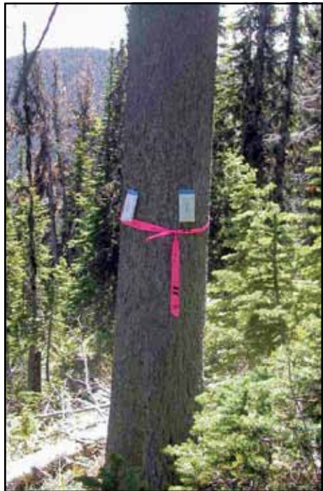
Figure 14. Verbenone can be an effective preventive treatment in some situations.