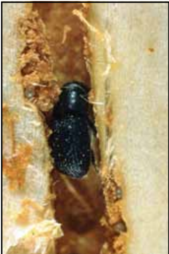
Figure 7. Mountain pine beetle adult and eggs in egg gallery.