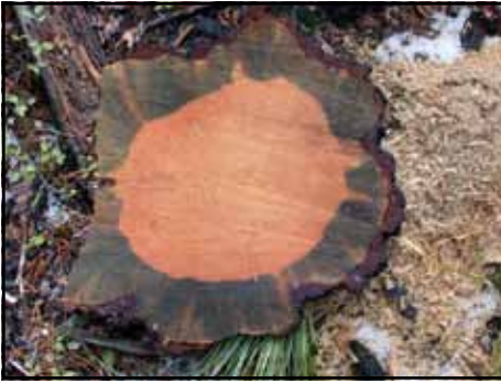
Figure 5. Blue-stained sapwood of a mountain pine beetle-killed tree.

year after attack. In unusually dry years, foliage may begin to fade within a few weeks. Needles change from green to yellowish green, then sorrel, red, and finally rusty brown (Figure 4, see page 3). Fading often begins in the lower crown and progresses upward in lodgepole pine, but may vary somewhat with other hosts. In large-diameter, tall sugar pines, for example, upper crown fading may be the first sign of an infestation.