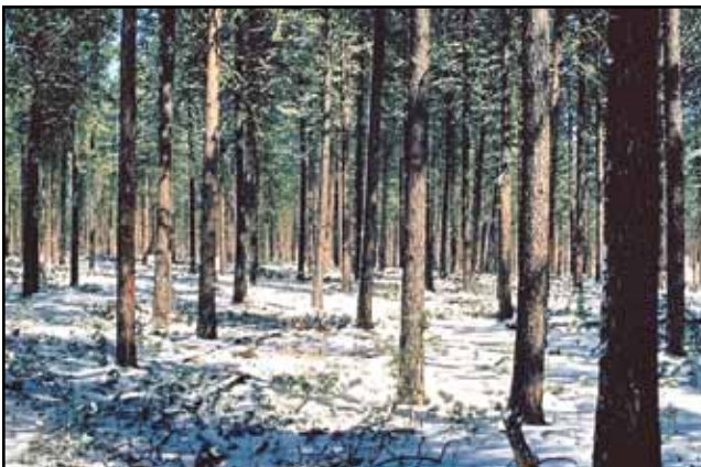
Figure 15. Silvicultural treatments offer the best long-term means of protecting susceptible stands from mountain pine beetle infestation.

Silviculture . Silvicultural measures, such as thinning (Figure 15), have been shown to minimize mountain pine beetle-caused tree mortality in some lodgepole and ponderosa pine stands if performed prior to outbreak initiation. Opening the stand through thinning influences beetle