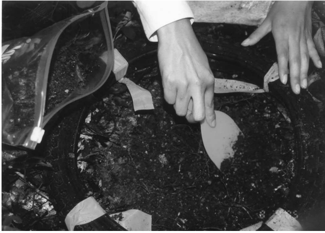
Figure 2. Litter and duff layers collected separately within a 30.5-cm-diameter bicycle tire and bagged in plastic for transporting to laboratory (Monongahela National Forest, WV). For each litter and duff sample, four depth measurements were made (at the ends of four ribbons at 90° angles approximately 6 cm from the inside of the tire).

2005, we sampled a 13-year-old loblolly pine ( Pinus taeda ) plantation on Weyerhaeuser lands in Washington County, North Carolina (Table 1). Samples were collected from representative forest conditions at each of the locations.