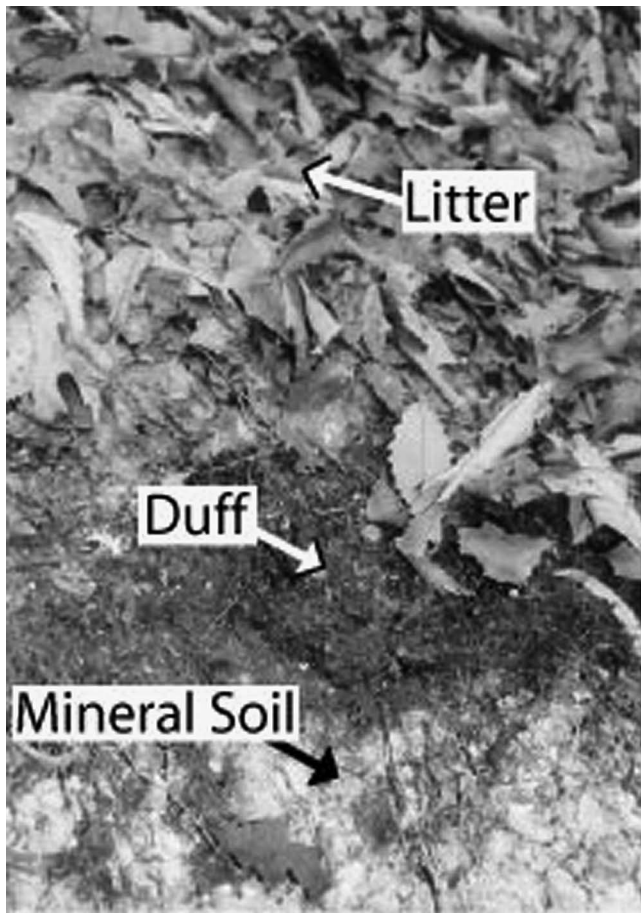
Figure 1. Forest floor litter and duff layers above mineral soil (Shenandoah National Park, VA).

ownerships (Bechtold and Patterson 2005): a phase 1 (P1) consisting of remote-sensing coverage to determine forest area; a phase 2 (P2) grid of field plots to measure trees; and a phase 3 (P3) subsample of P2 field plots to collect more detailed forest health information, including duff and litter measurements.