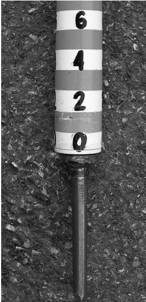
Fig. 1. VOR bands are 0.5 inches high and alternate white and gray, with the 1st VOR band labeled as 0. The 3-inch spike is attached.

ranges from 30 to 78 cm. Temperature at Burgess Junction ranges from -44^{\circ} to 31^{\circ}\text{C} , with an average of 0.8^{\circ}\text{C} (WRCC 2005). Growing season at these elevations is between 50 and 55 days (Nesser 1986). The study area was confined to areas where soils are derived from sedimentary material. These soils generally support a greater and more diversified herbaceous cover than granitic soils (Hurd and Pond 1958). Also, sedimentary soils are more basic and generally fine textured with high nutrient levels and soil water holding capacity (Nesser