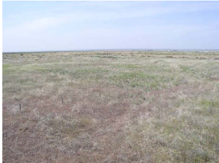
Orchard test site on May 16, 2007.

The Orchard Display Nursery was planted on November 16, 2004 in cooperation with the Great Basin Native Plant Selection and Increase Project. The nursery includes 82 accessions of 27 native and introduced grass, forb and shrub species. Each accession was planted in 7 X 60 foot plots. See Tilley et al (2005) for descriptions of the species and accessions planted. The remaining area was planted to a cover crop mix of 50% Anatone bluebunch wheatgrass, 20% Bannock thickspike wheatgrass, 20% Magnar basin wildrye and 10% Snake River Plains fourwing