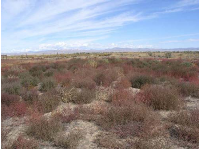
Orchard display site in September 2004 prior to final mechanical seedbed preparation

The Bureau of Land Management (BLM) burned the site in the fall of 2002. The site was later sprayed by PMC staff in May 2003 and May 2004 with a Roundup/2, 4-D herbicide mix to create a weed free seedbed. Due to limited breakdown of dead grass clumps that would inhibit proper seed placement with a drill and to ensure a clean seedbed, the decision was made to cultivate the site with a culti-packer just prior to seeding. During the first evaluation most plots contained high numbers of Russian thistle ( Salsola sp.) and moderate amounts of bur buttercup ( Ranunculus testiculatus Crantz) plants.