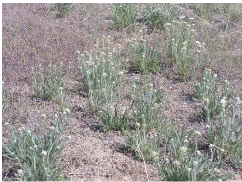
Stand of Eagle yarrow, May 2007.

Despite some good stands in 2005, all of the forb and shrub accessions except for Eagle yarrow had zero plants during the 2006 evaluation. Eagle had 0.07 plants/ft 2 in the frequency grids along with a small stand of plants at one end of the seeded plot. In 2007 more plants of Eagle had either germinated from the original seeding, or seed had spread from established plants. Plant density for Eagle in 2007 equaled 0.24 plants/ft 2 . Snake River Plains fourwing saltbush also had a single plant found in the plots, increasing its density from 0.00 to 0.02 plants/ft 2 .