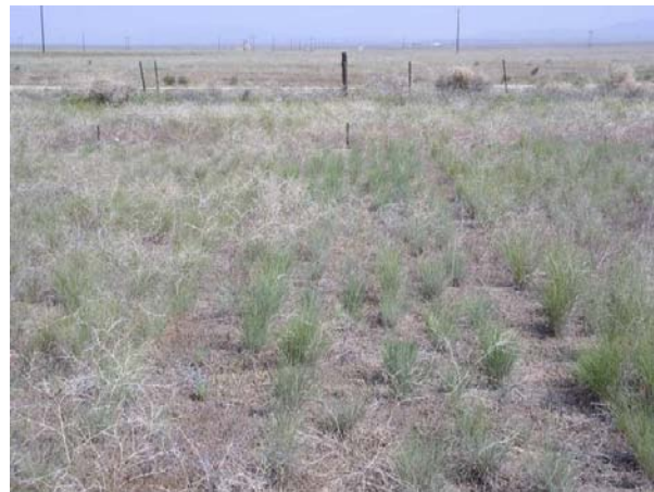
Jim Creek bluebunch wheatgrass, 2007.

The bluebunch wheatgrass accessions had the highest average densities of all the native grasses. All decreased slightly in density from 2005 to 2006, but still maintained good stands. P-12, Wahluke and Jim Creek all had densities over 1.00 plants/ft 2 . Columbia, Anatone, P-7 and P-15 had densities between 0.50 and 1.00 plants/ft 2 while P-5 and Goldar both shared low densities. In 2007 densities were generally slightly lower, but still higher than all other species as a whole. The highest density recorded in 2007 was Jim Creek at 1.07 plants/ft 2 .