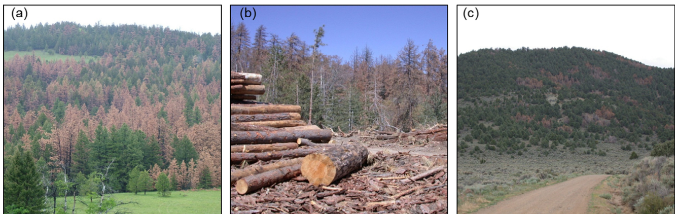
Fig. 1. Examples of extensive tree mortality in the western U.S. caused by bark beetles during severe drought in the early 2000s. (a) Pine forests of the Intermountain West due to mountain pine beetle ( Dendroctonus ponderosae ) (photo B. Bentz, USDA Forest Service). (b) Pine forests of southern California due to western pine beetle ( Dendroctonus brevicomis ) (photo: C. Fettig, USDA Forest Service). (c) Pinyon pine forests (e.g., Pinus monophylla ) of the southwestern U.S. due to pinyon ips ( Ips confusus ) (photo: C. Fettig, USDA Forest Service).