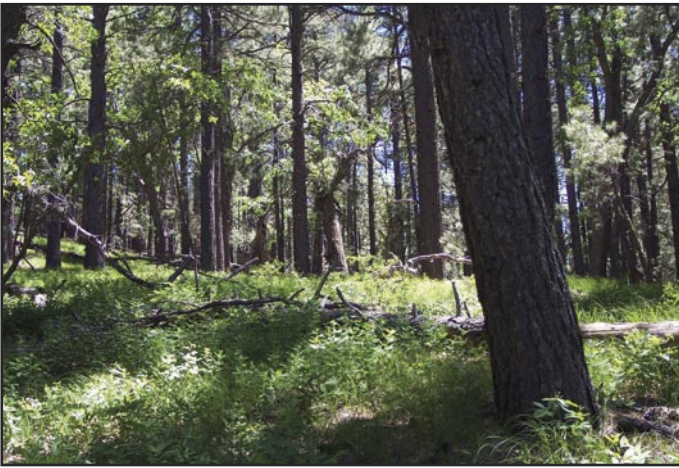
Figure 2. top ) A portion of the study area occupied by both Mexican spotted and great horned owls. Typical foraging habitat for great horned owls appears in the foreground. Great horned owls often hunted meadow edges bordered by large trees and snags. Spotted owls typically foraged in the interior forests on the butte behind the meadow. bottom ) Interior view of pine-oak forest typically used by foraging spotted owls. Note relatively dense forest cover, presence of oak understory, and numbers of down logs.

others 1998), whereas spotted owls appear to forage largely at night (Delaney and others 1999; Forsman and others 1984, 2004; Ganey 1988; Gutiérrez and others 1995; Sovern and others 1994; but see Laymon 1991; Miller 1974).