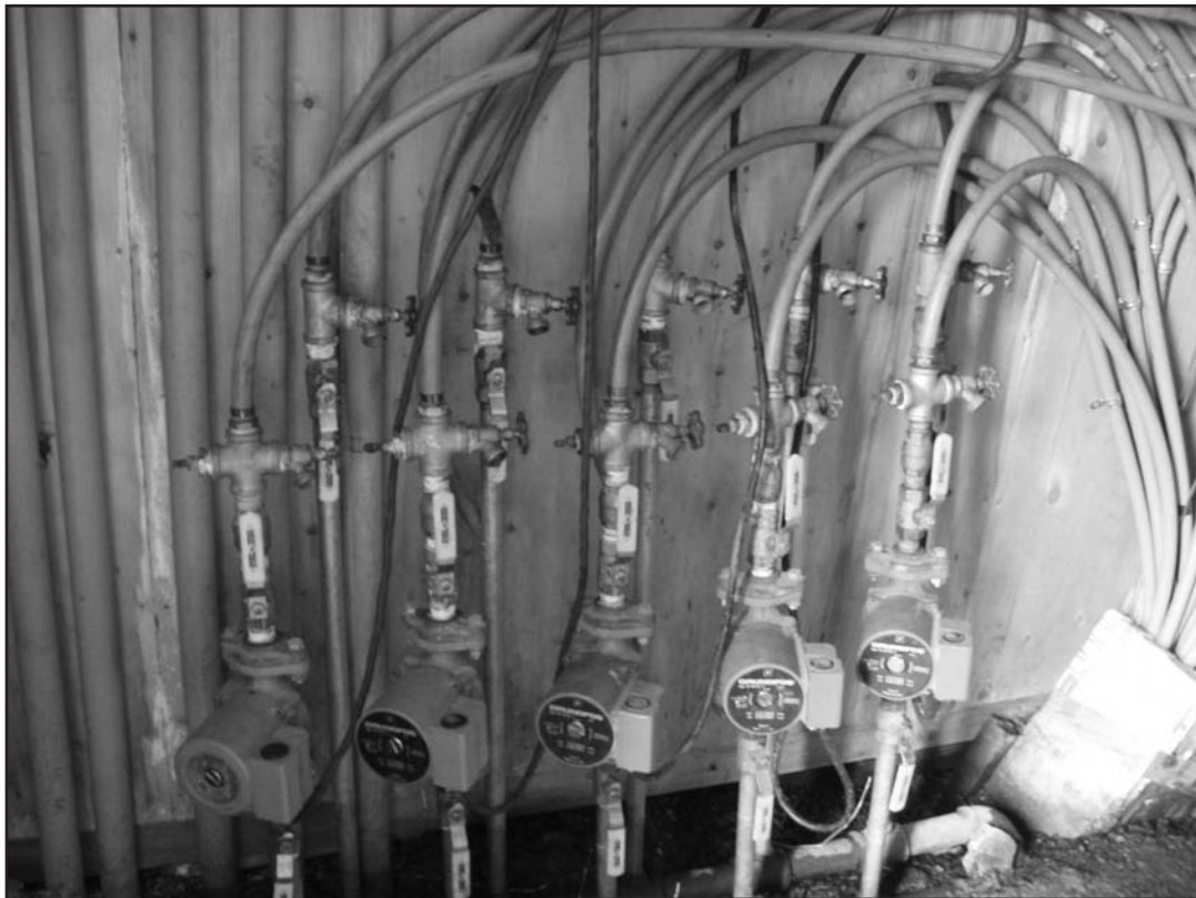
Figure 2. Pumping system for hot water distribution to heat greenhouses.

The content of this paper reflects the views of the authors, who are responsible for the facts and accuracy of the information presented herein.