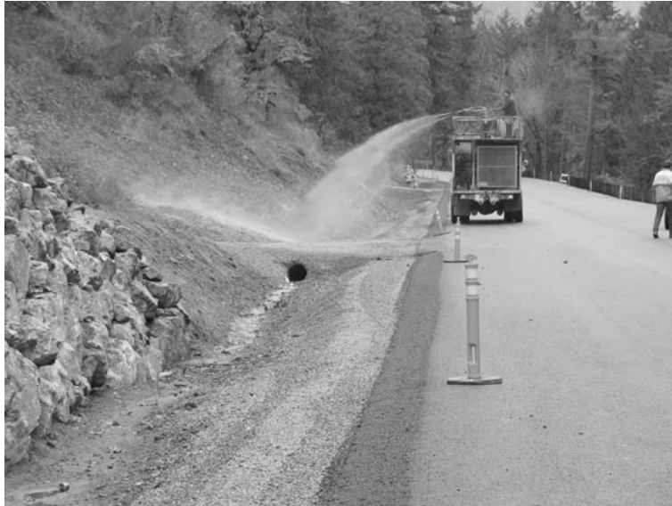
Figure 1 —Hydroseeding is one of the best ways to revegetate highway cuts and fills and retard soil erosion. Hydromulch techniques have been modified to improve effectiveness with native species seeds.