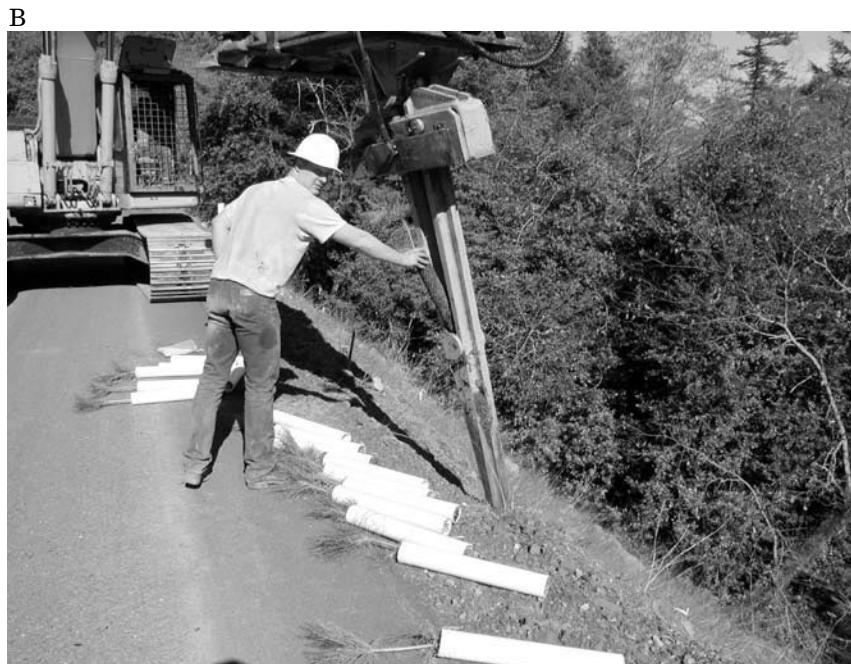
Figure 4 —An expandable stinger allows deep-rooted seedlings to be planted on steep or otherwise inaccessible slopes (A). Deep-rooted seedlings can be loaded into the magazine and planted at the proper depth on the slope (B) (figure A by Steve Morrison; photo B by David Steinfeld).