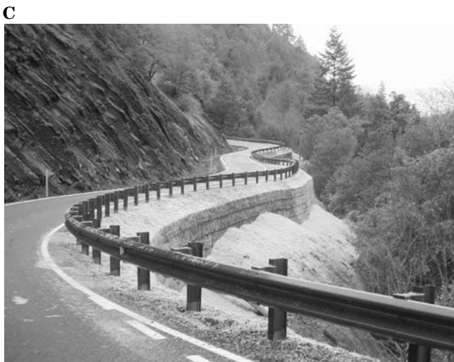
Figure 2 —Revegetating steep slopes and gabion walls can be a challenge. Native grass and forb seeds can be glued to erosion control blankets (A) and installed on steep slopes (B) or on the outside of gabion walls (C).