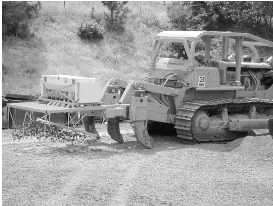
Figure 3 —Shallower slopes can be seeded with tractor-driven equipment, including a ripper modified to include a seed drill with a drag-chain to cover seeds with soil.