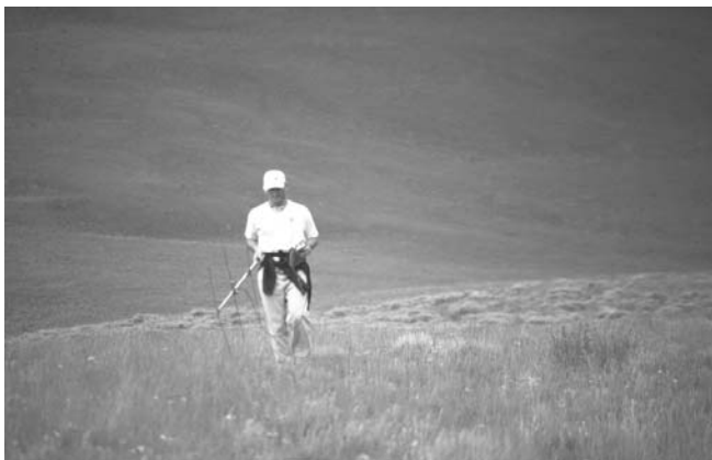
Figure 3 —Radio-tracking sage-grouse in high-elevation summer range with a stand of mountain big sagebrush in the background (photograph by J. W. Connelly).

Fall (late September into early December) is a time of change for sage-grouse from being in groups of hens with chicks or males and unsuccessful brood hens to separation