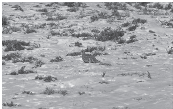
Figure 4 —Sage-grouse winter range in Wyoming big sagebrush habitat in North Park, Colorado.