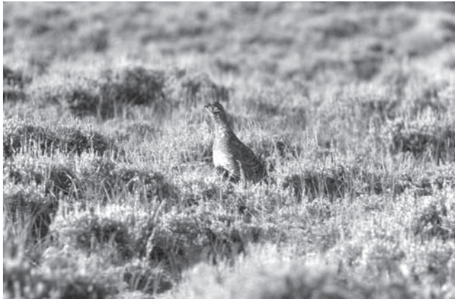
Figure 2 —Sage-grouse brood hen in good quality Wyoming big sagebrush habitat, North Park, Colorado.

adequate forage, especially succulent forbs, and cover useful for escape. These habitats may include those used for agriculture, especially for native and cultivated hay production, edges of bean and potato fields, as well as more typical sagebrush uplands and moist drainages. Taller (>40 cm) and robust (10 to 25 percent canopy cover) sagebrush is needed for loafing and escape cover as well as a source of food. Grass and forb ground cover can exceed 60 percent (hayfields). Provided moisture is available through water catchments or from succulent foliage, sage-grouse may be widely dispersed over a variety of habitats during this period (Connelly and others 2000a). As late summer approaches, there is movement from lower sites to benches and ridges (fig. 3) where sage-grouse forage extensively on leaves of sagebrush.