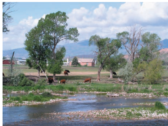
Cattle grazing on a remnant riparian area. Bear River, southeastern Idaho.

Developing buffer width guidelines based on scientific data that are responsive to regional landscape characteristics is essential to long term enhancement of water quality in the region. Buffers are particularly effective when combined with other conservation practices.