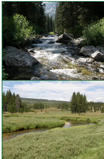
Typical confined (top) and unconfined (bottom) valleys studied in central Idaho.

Benefits to Resource Managers: With a growing body of research emphasizing the importance of valley bottom confinement for aquatic and riparian applications, mapping the locations and quantifying the abundance of confined and unconfined valleys is an important aspect of managing resources in riverine landscapes of mountain basins. The VCA is a powerful GIS tool for landscape scale analysis of valley form and is useful for meeting aquatic management goals.