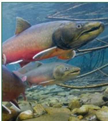
Adult male bull trout in spawning color.

Like many fishes native to the Rocky Mountains and the Pacific Northwest, bull trout ( Salvelinus confluentus ) have declined in response to changes to flow regimes, habitat alteration, and invasion of non-native species. Climate change has only exacerbated these conditions and, as a result, the species is now distributed in highly fragmented populations throughout its range. Bull trout may be especially vulnerable to the effects of a warming climate because they need access to large, interconnected habitats of cold water. As such, they are a useful biological indicator of the effects climate change will have on mountain stream ecosystems.