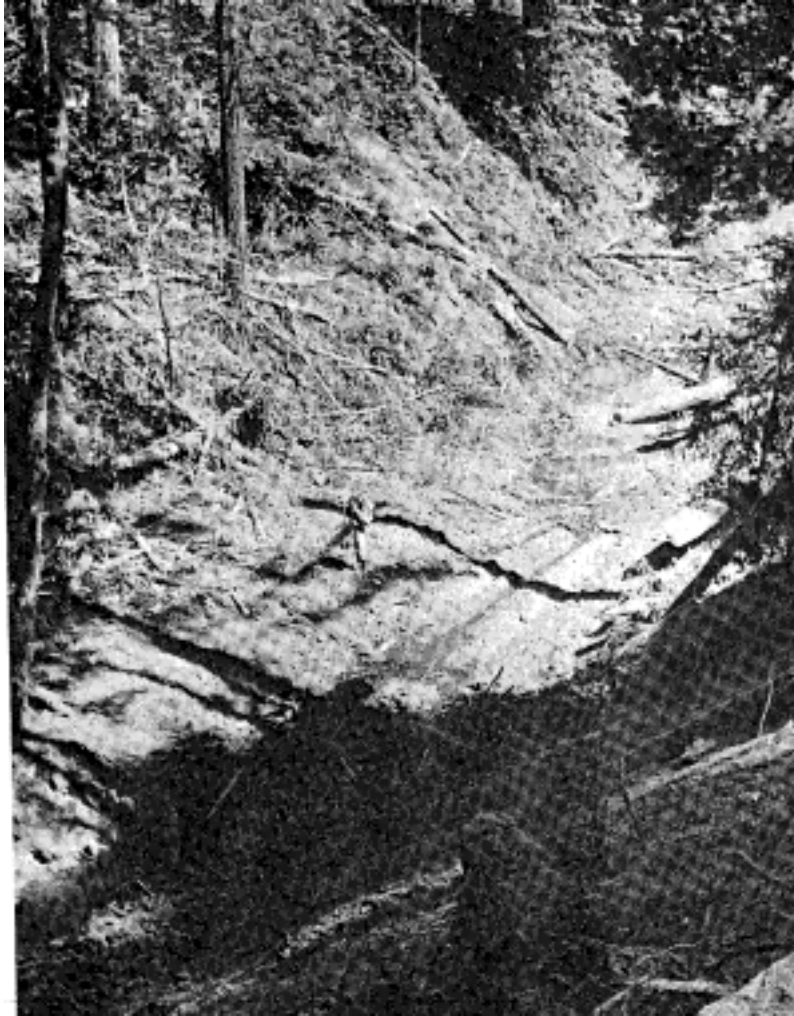
FIGURE 3-South Fork Caspar Creek, Mendocino County, immediately after road construction in 1967. A bulldozer operated extensively in the stream channel and materials from road building slid into the stream.