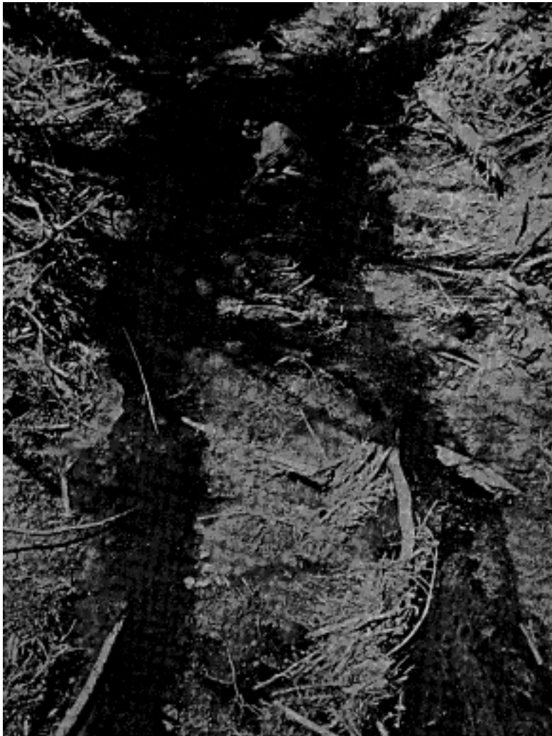
FIGURE 2-Little North Fork Noyo River, Mendocino County, immediately after logging debris removal, 1969. The stream's course was formed by bulldozer tracks.