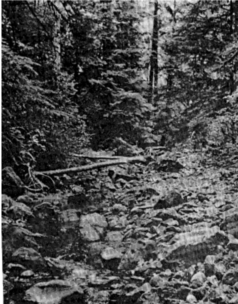
FIGURE 1-Bummer Lake Creek, Del Norte County, before logging 1967. Boulder and rubble sized materials made up the streambed.