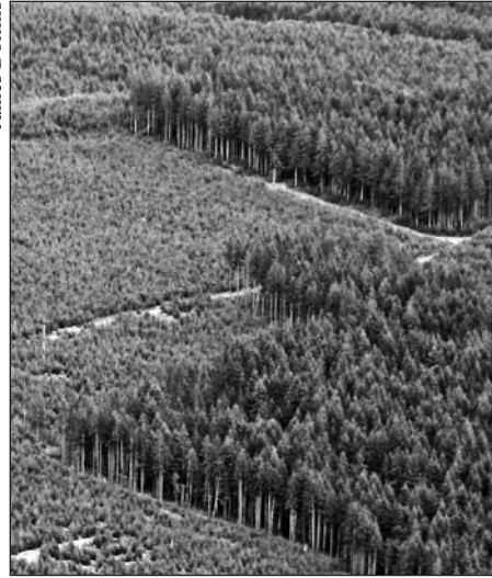
Questions about sustained, long-term productivity are of particular interest to private landowners who intensively manage forests.