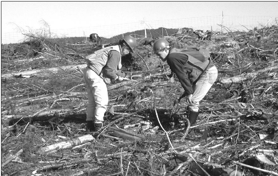
The Fall River study on Weyerhaeuser Company land in Washington examines the importance of residual organic matter in sustaining soil productivity and the effects of competing vegetation and harvest-related soil compaction on tree growth.

“Given that the state of the soil determines what can be grown for how long, preserving the basis of wealth of future generations requires inter-generational land stewardship.”