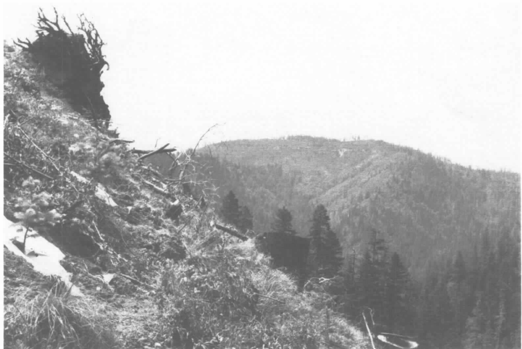
Figure 1—A progeny-test plantation established after slash had been broadcast burned. Note the scattered debris and charred stumps. Most plantations were not this steep.