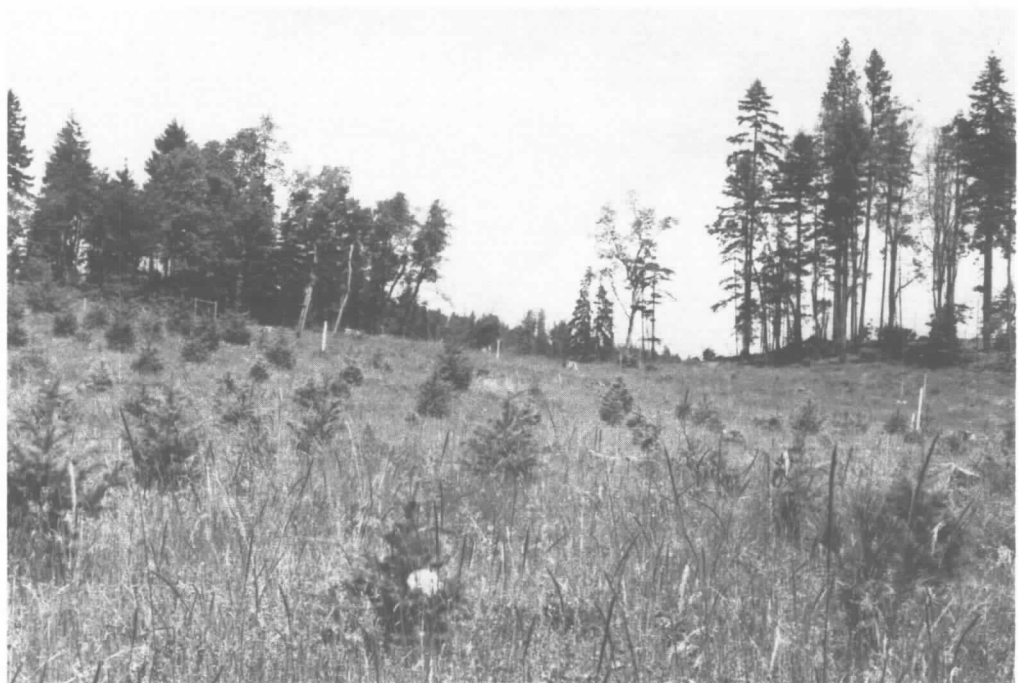
Figure 2—A progeny-test plantation established after slash had been piled and burned. Note the dense grass cover and absence of debris.