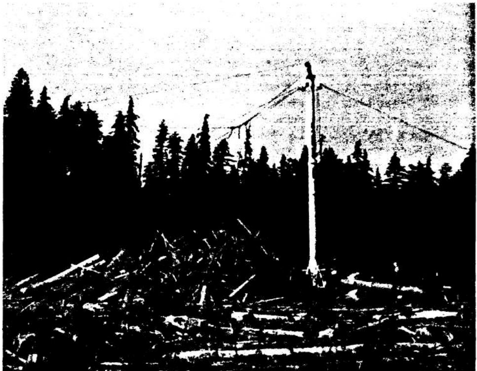
Figure 1.—High-lead tower yarding to residue pile on Unit 1, Trout Creek Hill timber sale.