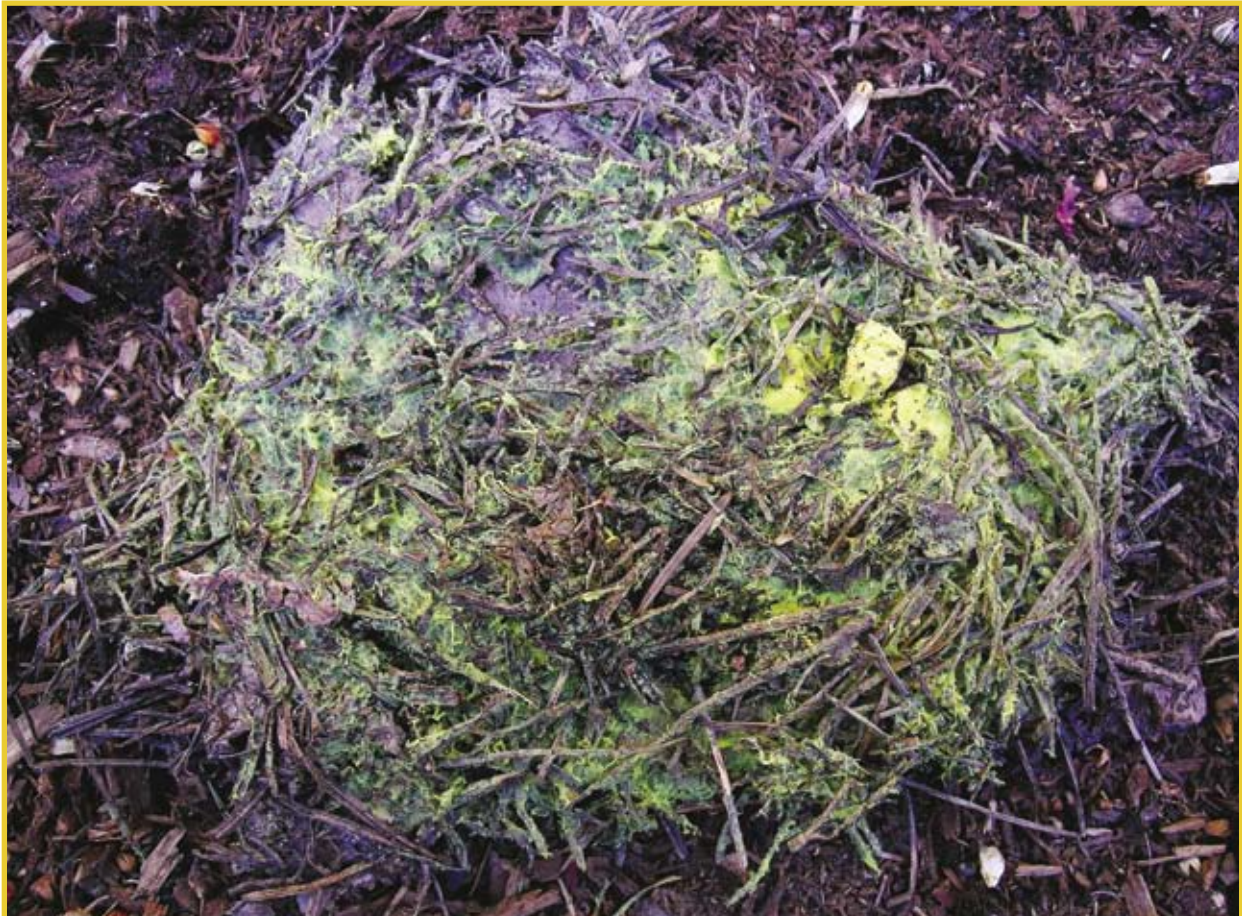
Matt Trappe, Oregon State University, Department of Environmental Science

This colorful mat of fungal hyphae was formed by the truffle species Rhizopogon truncatus at Crater Lake National Park, and found during a JFSP study examining prescribed fire/fungal interactions. The occurrence of many of these mat-forming fungi is correlated with litter and woody debris mass. Consequently, they may be vulnerable to severe fires.