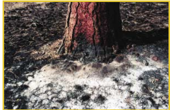
Trygve Steen, Fire and Fire Surrogate Program, Hungry Bob Site

Areas at the base of trees, particularly large-diameter pines, often burn much hotter than surrounding areas, as indicated by the white ash on the soil surface. The heat is generated by the burning of accumulated bark and needle litter and may cause mortality of fine roots and even the tree itself.