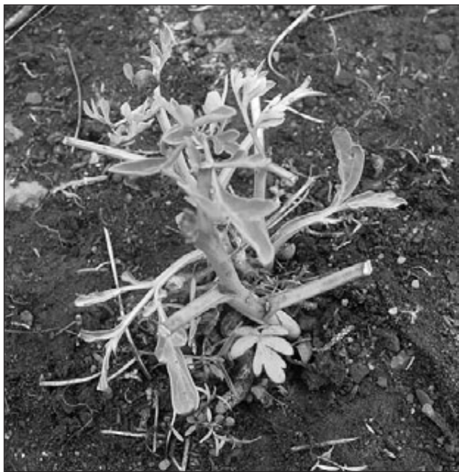
Brown's peony browsed by a large ungulate, presumably elk.

numerous shrubs and forbs flowered concurrently with the peony: prostrate ceanothus ( Ceanothus prostratus ), greenleaf manzanita ( Arctostaphylos patula ), Carey's balsamroot ( Balsamorhiza careyana ), dwarf hesperochiron ( Hesperochiron pumilus ), woodland star ( Lithophragma parviflora ), chocolate lily ( Fritillaria lanceolata ), and two desert parsleys ( Lomatium triternatum and L. nudicaule ). Perhaps because of the recent wildfire, the peony plants had been heavily browsed. Brown's peony began flowering in late April and continued through May. In late August I gathered about 50 seeds from several plants that successfully bore mature fruit, although not all seeds were well developed.