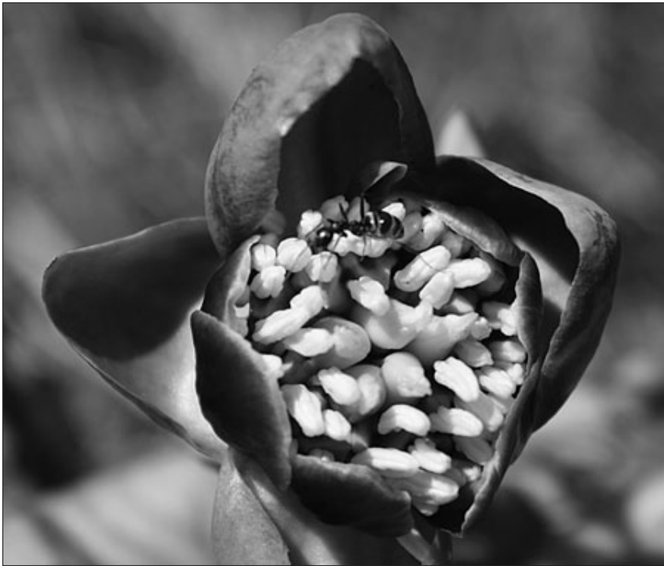
Open flower, revealing stigmas, anthers and partially hidden lobes of the nectariferous disc.

Seeds are food for rodents as well as arthropods, so animal dissemination is possible (Schlising 1976). Although birds and rodents travelling with seeds may drop or bury them, I saw no direct evidence of that; instead, I noted seedlings close to the parent plants. Sometimes seeds from a single flower germinated together to form a small cluster.