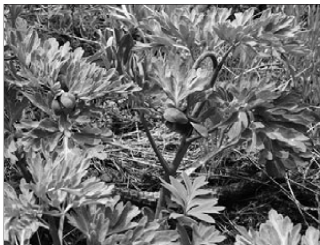
Partially shaded plants of Brown's peony with stout purple-red stems and buds in early spring at the Puffer Butte location.

Of the 50 mature seeds I collected at Green Ridge, 92% were filled and appeared viable. Fully developed seeds are plump and contain a starchy white endosperm and a tiny embryo at one end. Seeds vary in size, ranging from 0.2 to 0.5 inch at their widest diameter.