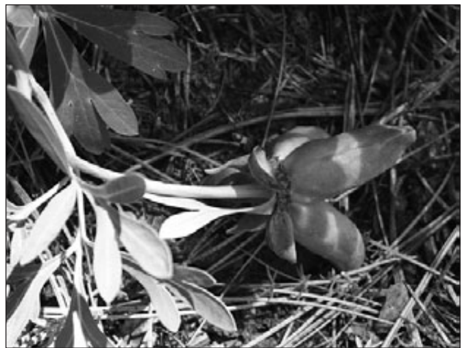
The fully developed fruit of Brown's peony beginning to ripen.

they accidentally pick up pollen grains. A diverse mix of pollen grains on these bees suggested that they frequented a variety of co-flowering shrubs and herbs and visited the peony flowers only for nectar. In the spring, females may take nectar back to the nest to mix with the pollen to feed the larvae; or they may stop for nectar to renew their energy while returning to their nest after gathering pollen (the bee equivalent of stopping for a double latte on the way home from work). Although bees appeared to visit Brown's peony at the Blue Mountain study site after flowers petals opened during