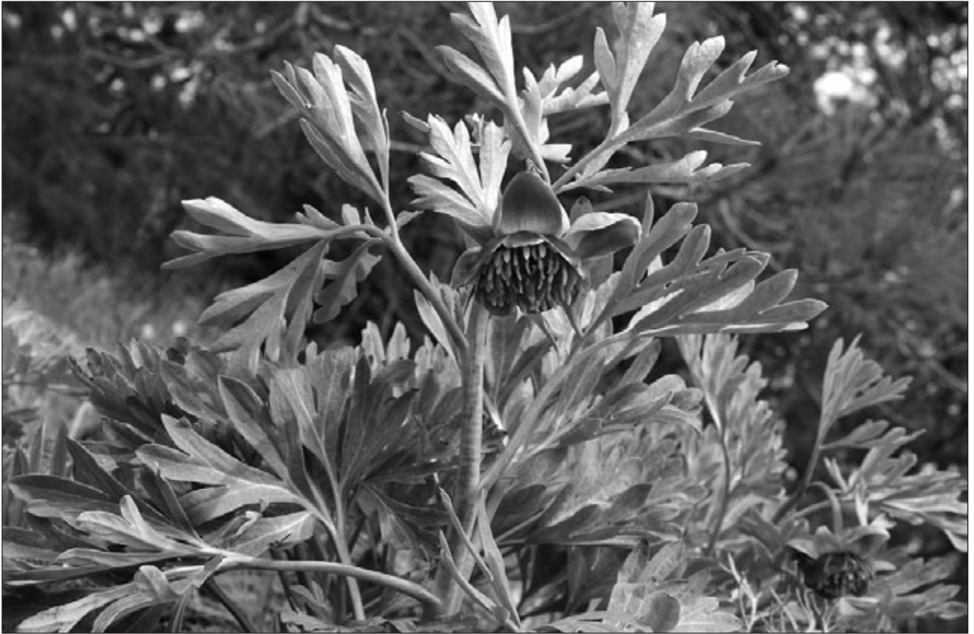
Brown's peony flowering in open prairie near the forest edge.

3930 NW Witham Hill Dr., Corvallis, OR 97330