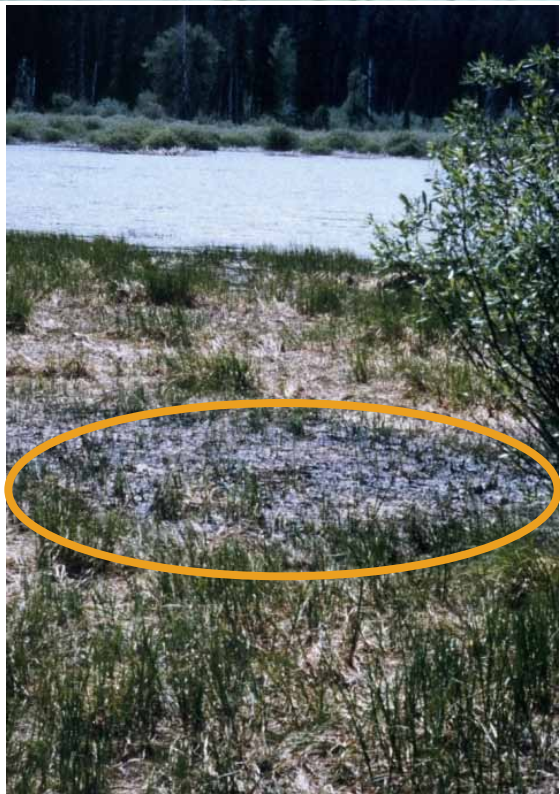
Above: The receding shoreline of Lost Lake, Oregon, USA, left an estimated half-million Western Toad ( Anaxyrus boreas ) eggs high-and-dry in 1989 (Blaustein and Olson 1991, Science 253: 1461), after several years with below-average precipitation. Mass mortality episodes such as this are projected to increase in many areas due to reduced precipitation, increased temperature, or changed seasonal weather patterns.

Amphibian and reptile conservation is of paramount concern in the US, Australia and worldwide as the tally of species and population declines continues to mount. Habitat loss, degradation and fragmentation are the chief causes of losses. In many areas. Climate is tightly linked to habitat conditions and the biology of these species. Amphibians have been previously considered environmental indicators because they are especially sensitive to temperature and moisture regimes, are centrally nested in food webs, have complex life histories, and rely on both aquatic and terrestrial habitats. Turtles share some of these characteristics, making them particularly vulnerable to changes in their environments. Lizard reproductive failure and overwinter mortality have resulted from recent variation in seasonal weather patterns – hence, concerns have been raised for them as well, especially lizards in temperate-zone habitats. Similar concerns have been raised for snakes. Changes in communities due to climate-driven habitat alteration are not well understood. Temperature-dependent sex determination in some lizards and turtles may be affected by climate variation, with consequences for future reproduction if only one sex is produced. Furthermore, interactions of climate with other stressors on these taxa are little studied.