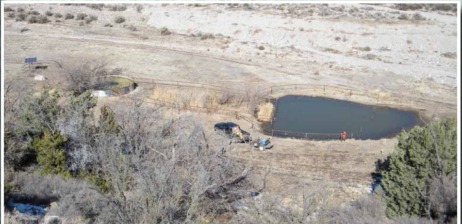
Above: Breeding site enhancement and hydroperiod manipulation are potential tools to consider to manage the effects of variable climate conditions on amphibians. In this photograph, a wind- and solar-powered pump system is used to maintain the water level in a constructed pond, drawing from groundwater sources in New Mexico, USA. These ponds benefit a host of wildlife, but in particular, they provide essential habitat for the threatened Chiricahua Leopard Frog ( Lithobates chiricahuensis ). (Photo: Turner Ranch Properties, L.P.; M. Christman, USFWS, Albuquerque, NM; C. Kruse, Turner Enterprises, Inc.; Fig. 1 in Shoo et al. 2011.)

“Adaptation management” is a term that natural resource managers use to describe what can be done to address threats to species, such as climate change. It includes habitat protection and restoration measures. Key tools in the manager toolbox to address the effects of climate change on amphibians and reptiles are provided on the back of this page. These tools likely provide benefits to a host of other taxonomic groups as well.