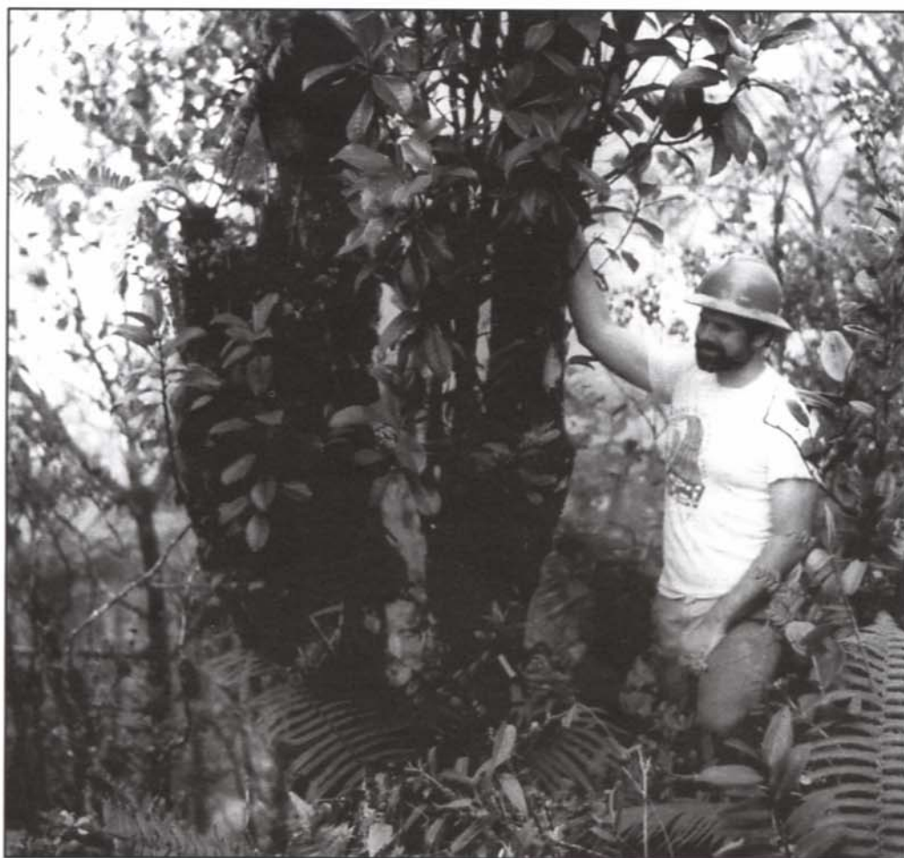
Figure 3. —Laurel sabino ( Magnolia splendens Urban) in the dwarf forest of Puerto Rico's Luquillo Mountains. Note the numerous sprouts at the base of the tree, possibly resulting from the effects of Hurricane Hugo in September 1989.

Vegetative Reproduction. —Laurel sabino trunks typically produce numerous new shoots or suckers (21). Much of this vegetative reproduction may be attributed to recovery after tropical storms or hurricanes (fig. 3).