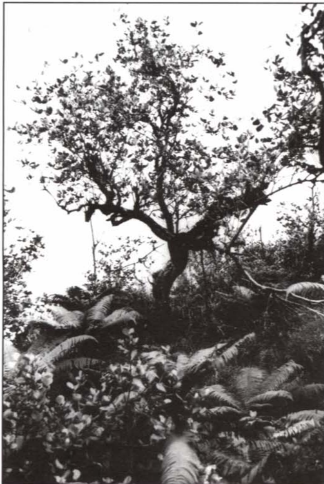
Figure 1.— Laurel sabino ( Magnolia splendens Urban) in the dwarf forest of Puerto Rico's Luquillo Mountains.

Magnolia splendens Urban, called laurel sabino in Spanish and magnolia in English, is an evergreen tree species endemic to northeastern Puerto Rico (fig. 1). When mature, laurel sabino supports a narrow, dark-green crown and may reach 25 m in height and 1.2 m in d.b.h. Identifying features include its large leaves that have a spicy taste when bitten into and that are covered with silky gray hairs; a terminal stipule that falls, leaving a ring scar on the branch; long, pointed terminal buds; and large white flowers (21, 31). Because the wood was highly regarded for use in furniture and cabinet making, laurel sabino was harvested in the Luquillo Mountains through the early 1950's (32, 40).