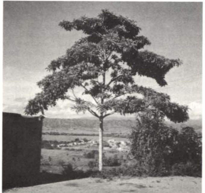
Figure 1. — Young jagua ( Genipa americana ) tree growing in Puerto Rico.

Across its large range, the jagua tree grows in association with many species; two examples are given here. On a riverbank site in the Atrato Valley in Colombia, jagua trees may be found growing with Artocarpus altilis (Parkinson) Fosberg, Cecropia sp., Cedrela sp., Cespedesia macrophylla Seem., Guilielma gasipaes (H.B.K.) Bailey, Gustavia superba Berg, Inga sp., Luehea seemannii Planch. & Triana, Parkia sp., Pithecellobium sp., Vismia sp., and Vochysia sp. (15). In Puerto Rican forests, jagua is usually confined to