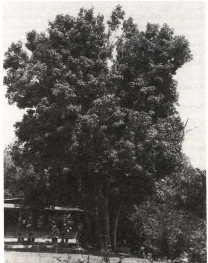
Figure 1.—Clump of young quenepa ( Melicoccus bijugatus ) trees growing in Puerto Rico.

Quenepa was noted on the island of St. John, U.S. Virgin Islands, in association with Maytenus laevigata (Vahl) Griseb. ex Eggers, Guapira fragans (Dum.-Cours.) Little, Ocotea coriacea (Sw.) Britton, Sabina florida (Vahl) DC., Inga fagifolia (L.) Willd., Bursera simaruba (L.) Sarg., Tabebuia heterophylla (DC.) Britton, Andira inermis (W. Wright) HBK., and Spondias mombin L. (24). On the island of St. Eustatius, Netherlands Antilles, quenepa was noted