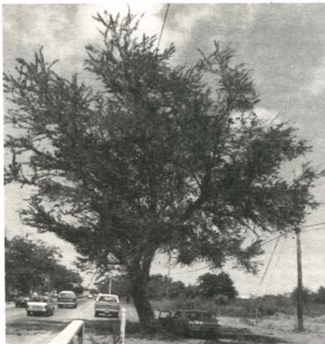
Figure 1.—Roadside planting of guamúchil ( Pithecellobium dulce ) near Ponce, Puerto Rico.

Where it is native, guamúchil is common in dry thickets or forests on coasts, plains, and hillsides to an altitude of 1,800 m (22, 26). The thorn forests of the Pacific Coastal Plain region of Mexico are characterized by poor, rocky soils on slopes adjacent to tropical savanna woodlands (6).