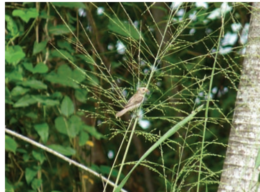
Figure 3. Female or young male Slate-coloured Seedeater Sporophila schistacea , Mancarroncito Island Nicaragua, 5 September 2009