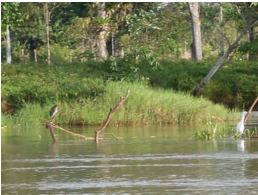
Figure 2. Striated Heron Butorides striata , río San Juan, Nicaragua, 10 March 2009; note the Snowy Egret Egretta thula for size comparison (Luis Sandoval)