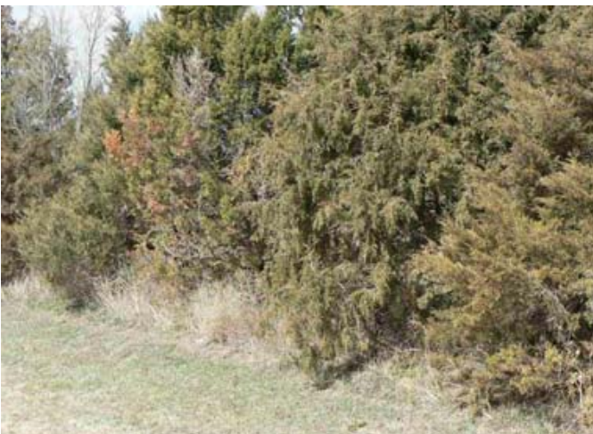
Juniper twig blight ( Phomopsis juniperovora )

Juniper blight is associated with three pathogens, Cercospora sequoia var. juniperi , Kabatina juniperi and Phomopsis juniperovora and these diseases can be found on both the eastern redcedar and Rocky Mountain juniper. Cercospora was found in several eastern redcedar windbreaks in eastern South Dakota. Kabatina and phomopsis were detected in scattered windbreaks throughout the state. Phomopsis was also associated with tip dieback in a number of ornamental plantings of Chinese junipers in Sioux Falls, S.D.