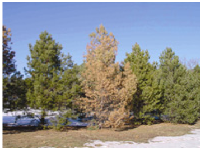
Scots pine mortality due to pinewood nematode ( Bursaphelenchus xylophilus )

Pinewood nematode ( Bursaphelenchus xylophilus ). Scotch and Austrian pines in the southern part of the state, south of I-90, from Lake Andes to Hot Springs are dying from pine wilt. Sampling of pines that expressed symptoms associated with the disease have also contained populations of the pinewood nematode. The number of trees found infected with this disease has increased dramatically during the past year, perhaps related to the continuing drought and mild