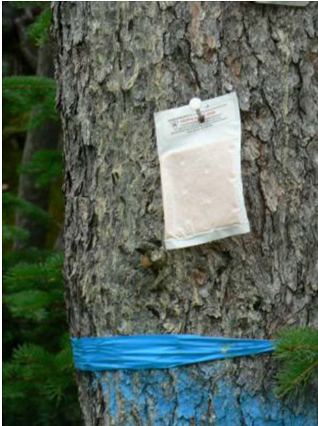
Verbenone pouch on limber pine

Pine engraver beetle ( Ips ). Pine engraver beetle populations have been very low during the past several years. However, they are beginning to increase dramatically and are causing some ponderosa pine mortality in the southern and central Black Hills. Pine engraver beetles are typically found in dead and dying trees, as well as slash piles, but the populations are expanding and are now becoming a major cause of tree mortality. The population is increasing again perhaps due to the number of trees killed by the mountain pine beetle. The increase in chipping, as a means of treating pines infested with mountain pine beetle, has attracted engraver beetles to these treated stands.