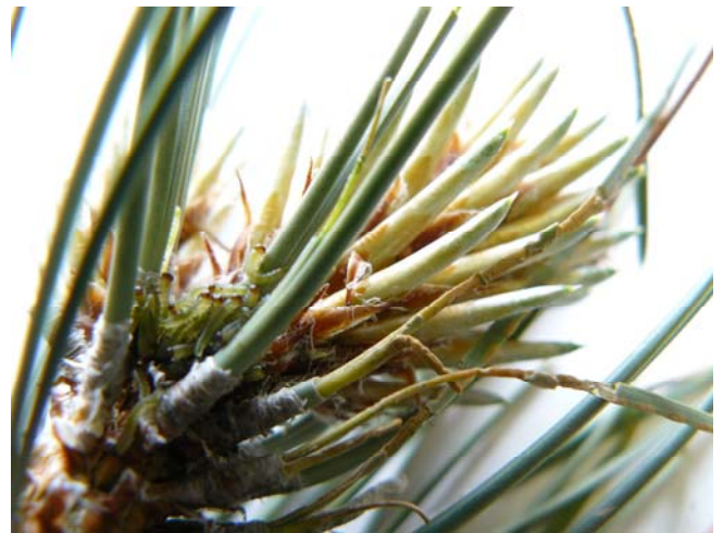
Pine Sawflies ( Neodiprion )

Pine Sawflies ( Neodiprion ). There were several small pockets of sawfly defoliation in ponderosa pine stands across the southern Black Hills, though less than has been experienced during the past few years.