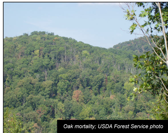
Oak mortality

Oak decline and red oak borer have diminished and more normal rainfall patterns have returned, resulting in a reduction in dieback and mortality. However, damaged trees that do survive are extensively riddled by borer tunnels and decay fungi so the results of the decline will persist until the damaged trees are eventually harvested. Conditions favorable for the development of future oak decline events persist over thousands of acres. Episodic drought, advanced age, and poor site quality of the state's oak forests indicate make this a serious and persistent problem.