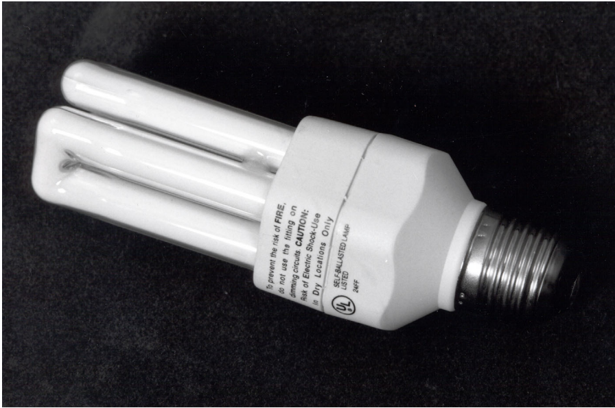
Figure 1—A 15-watt compact fluorescent light bulb that is rated to have the light output of a 40-watt incandescent light bulb.