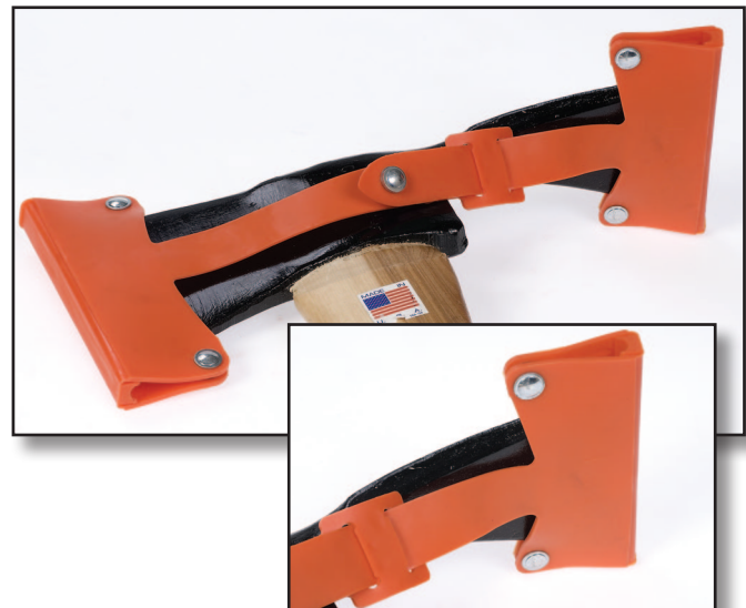
Figure 1—The existing Pulaski sheath has been used by trail maintenance and firefighting employees since the 1980s. The strap (inset) tends to slip through the buckle, allowing the toolhead covers to fall off.