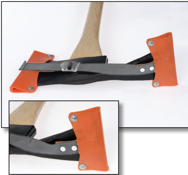
Figure 4—Rivet (inset) the 1-inch-wide webbing to the plastic strap.