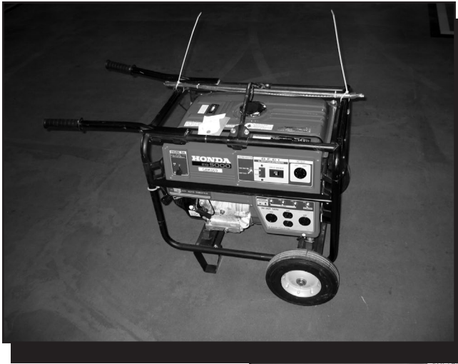
Figure 1—A small portable generator.

clude the standard 20-ampere, grounded, three-prong plug found in most households. However, the round locking three-prong plug (20- or 30-ampere rating) seen in figure 2 may be used. Always use the proper wiring and the proper plug for the power that is needed.