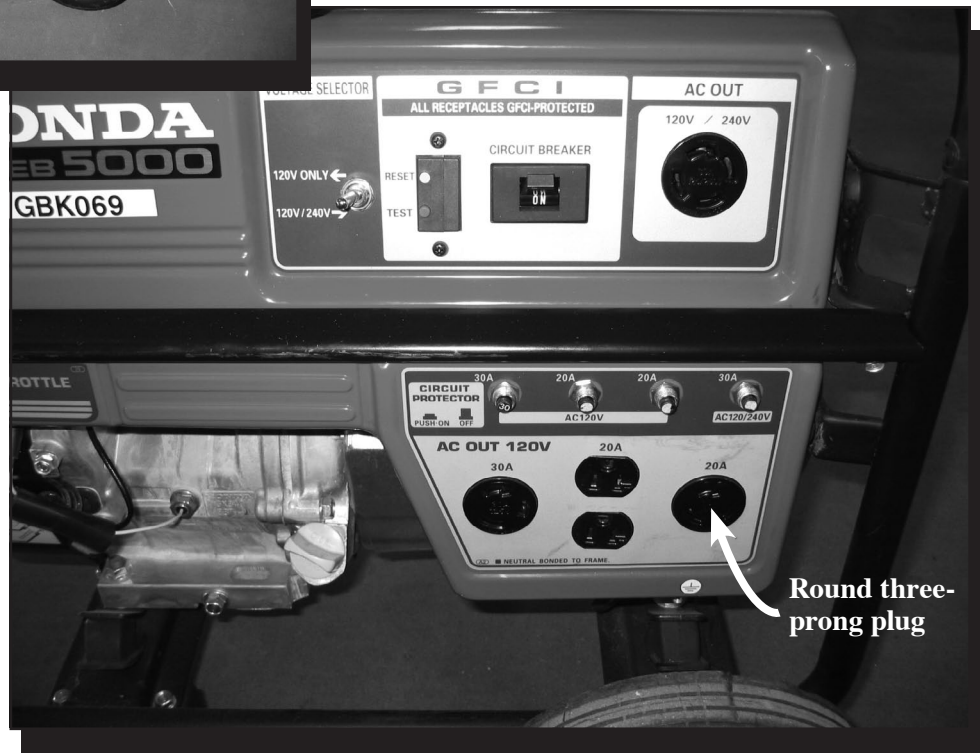
Figure 2—The control and outlet panel on a small portable generator.