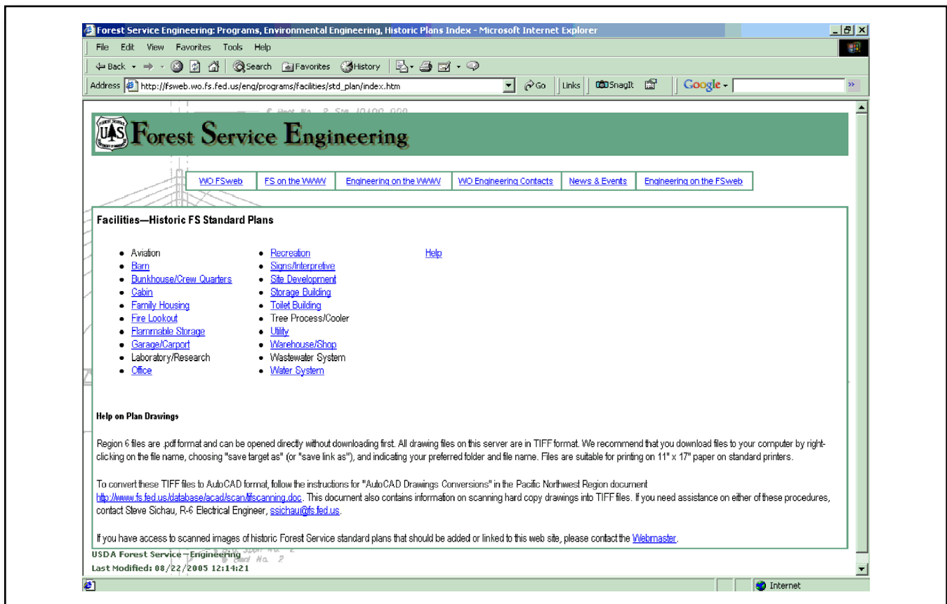
Figure 2—The Historic FS Standard Plans homepage: http://fsweb.wo.fs.fed.us/eng/programs/facilities/std_plan/ .

The Historic FS Standard Plans Web site has plans for many types of structures, as shown in figure 2, a screen shot of the opening page. Plans from Regions 1, 4, 6, 7, and 9 are