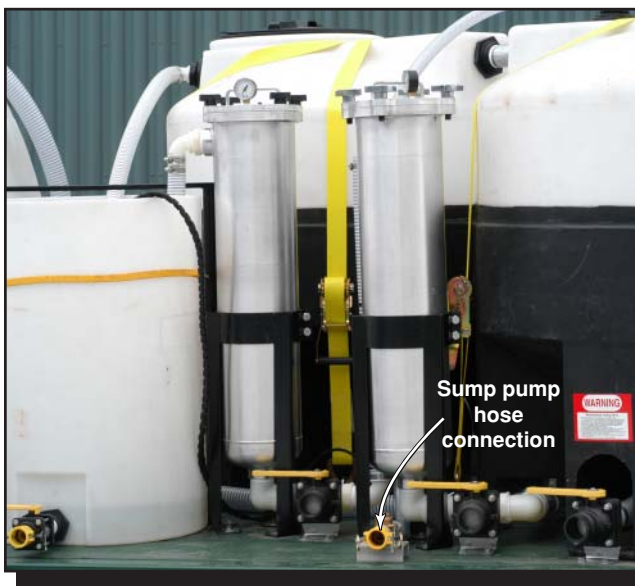
Figure 5—Two filter assemblies remove particulate from the wash water before the water flows back into the main holding tank for reuse.

for instance) than the second filter (50 microns, for instance). Pressure gauges on the top of each housing show the approximate internal pressure. When the pressure reaches 15 to 20 pounds per square inch, the filters are clogged.