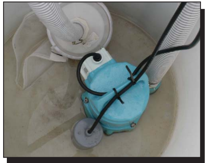
Figure 6—The sump pump in the overflow tank forces water through the two filter assemblies and into the main holding tank.

The other sump pump is placed on the containment mat (figure 2). It pumps water from the mat to the settling tanks. This pump should be at the lowest point on the containment mat, but close to the trailer so vehicles do not drive over the hose. In addition, a small valve has been added to the pump's outlet to help prime it. Simply open the valve (figure 7) to start the flow of water (priming the pump). Close the valve to start the flow to the settling tanks.