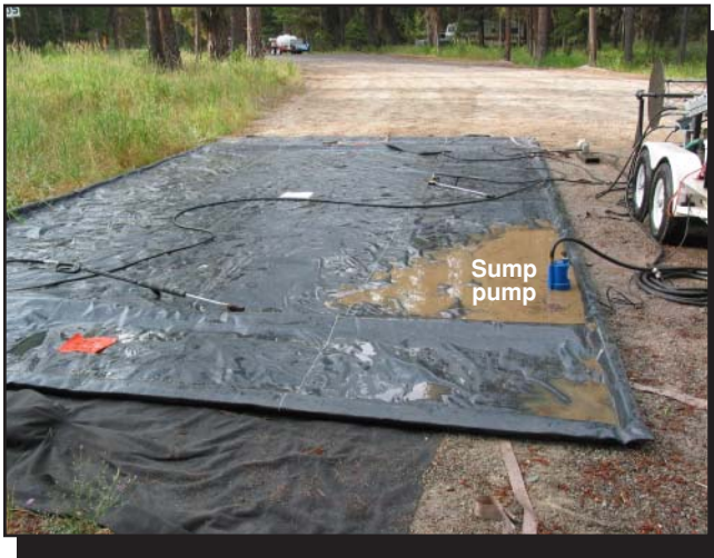
Figure 2—The containment mat's raised sides hold used water until it can be pumped from the mat and filtered for reuse.

The containment mat (19 feet wide by 33 feet long, figure 2) is made of a tough, durable, chemically resistant material. Foam inserts are placed into slots on the underside of the containment mat, creating a lip on all sides. Two different types of foam inserts are used. The cylindrical blue inserts are used on the sides. The square foam inserts wrapped in plastic are used for the ends. Use the square foam in the ends because the round blue inserts will quickly deteriorate if they are used there.