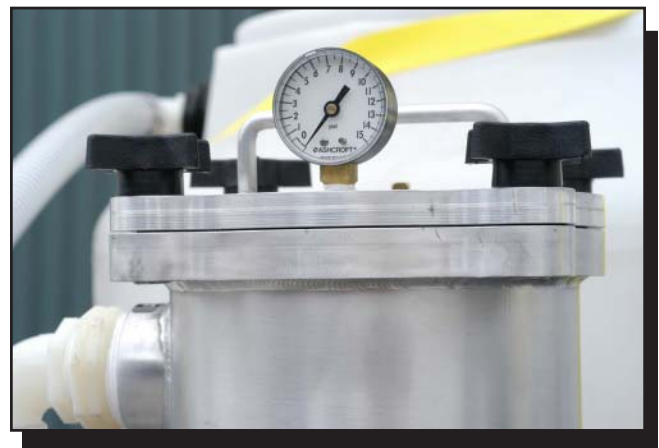
Figure 9—If the pressure at the filter assembly is higher than 15 to 20 pounds per square inch, the filters are probably clogged.