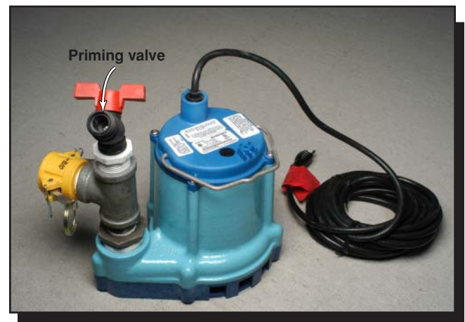
Figure 7—The sump pump on the containment mat pumps water to the settling tanks. Open the priming valve to prime the pump.