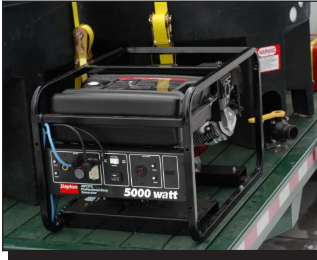
Figure 4—A Dayton generator powers the two sump pumps and could power other electrical appliances.

for instance) than the second filter (50 microns, for instance). Pressure gauges on the top of each housing show the approximate internal pressure. When the pressure reaches 15 to 20 pounds per square inch, the filters are clogged.