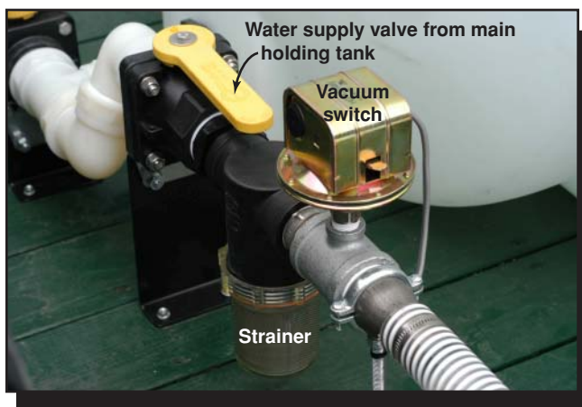
Figure 10—The vacuum switch stops the engine when the supply line is dry. The strainer removes floating materials before filtered water enters the main holding tank.

4 —Direct the driver of the vehicle to slowly drive onto the containment mat with the underbody washer centered under the vehicle. The more slowly the driver drives the vehicle over the sprayer, the cleaner the vehicle will be underneath.