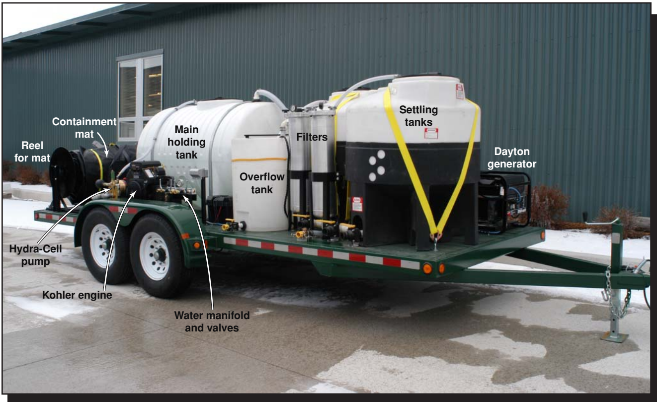
Figure 1—The MTDC portable vehicle washer allows vehicles to be cleaned thoroughly, removing fragments of vegetation, spores, and weed seeds that could spread noxious weeds.

The basic flow of water through the system starts in the main holding tank. Water flows from the holding tank through a strainer that removes large particulate, preventing damage to the pump. A vacuum switch prevents the pump from operating without water. The pump forces water through a manifold to the underbody washers or to wands used to wash the vehicle. A containment mat with raised edges holds used wash water until a sump pump removes the water, pumping it through two cone-bottom settling tanks. Large, heavy particulate settles to the bottom of the first settling tank. Overflow from this tank flows into the second cone-bottom settling tank, where the largest of the remaining particulate will settle to the bottom. The overflow from the second settling tank flows through a coarse filter bag (that removes floating material) and into an overflow tank. A sump pump, activated by a float switch,