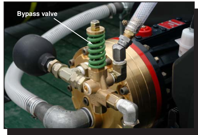
Figure 11—The bypass valve diverts water from the pump back to the main holding tank when the wands and underbody washers are not being used.

The bypass valve (figure 11) diverts water from the pump back to the main holding tank when the wands or underbody washers are not in use. Over time, if the pump is operated at high speed and the wands or underbody washers are not being used, the internal components of the bypass valve will wear and no longer seat properly. The result is very low pressure, with reduced water flow to the wands and underbody washers. If this should happen, the bypass valve will need to be replaced. Remove the bypass valve by loosening the three hydraulic fittings (water inlet, outlet to the manifold, and