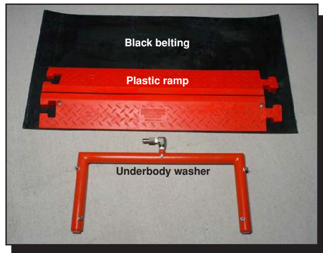
Figure 8—The underbody washer washes the underside of vehicles. The plastic ramp protects the hose to the sprayer. The black belting ensures that a vehicle's weight will hold the ramp in place when the vehicle drives over the belting and onto the ramp.

The vehicle washer has two underbody washers (figure 8) that wash the underside of the vehicles. One sprayer should be placed where vehicles enter the containment mat. The second washer should be placed at the other end of the containment mat, washing the undercarriage a second time as vehicles exit. Plastic ramps protect the hoses to the underbody washers.