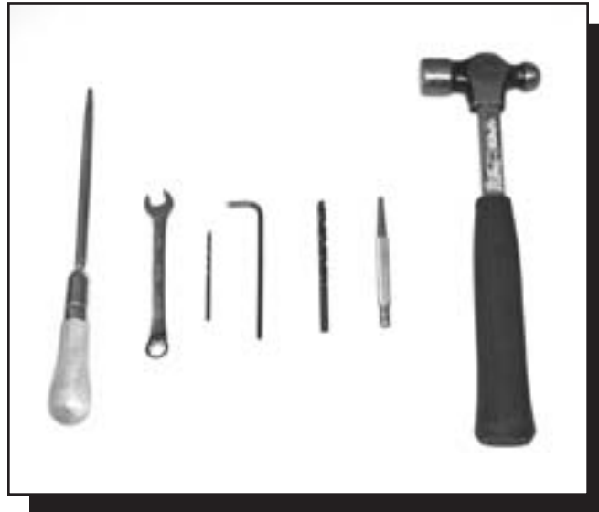
Figure 4—Tools that are needed to build an underbuck.

Figures 5 to 12 show how to assemble the underbuck tool.