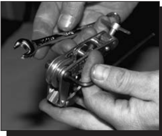
Figure 12—Place a lock washer and nut on the button-head cap screw and tighten the nut, using a \frac{5}{32} -inch hex key to secure the cap screw and a \frac{7}{16} -inch wrench to turn the nut.