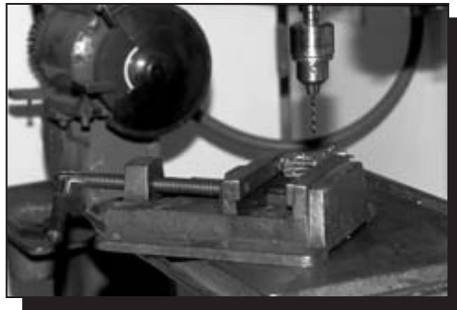
Figure 6—Secure the clamp in a vise to prevent it from moving.