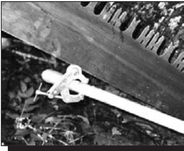
Figure 15—Clamp the underbuck on the handle so the grooved sheave lines up with the top of the saw kerf.