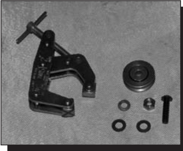
Figure 3—Parts that are needed to build an underbuck.

The components cost about $25, including shipping and handling (figure 3). We were not able to find another supplier that had all the parts and would sell them in small quantities.