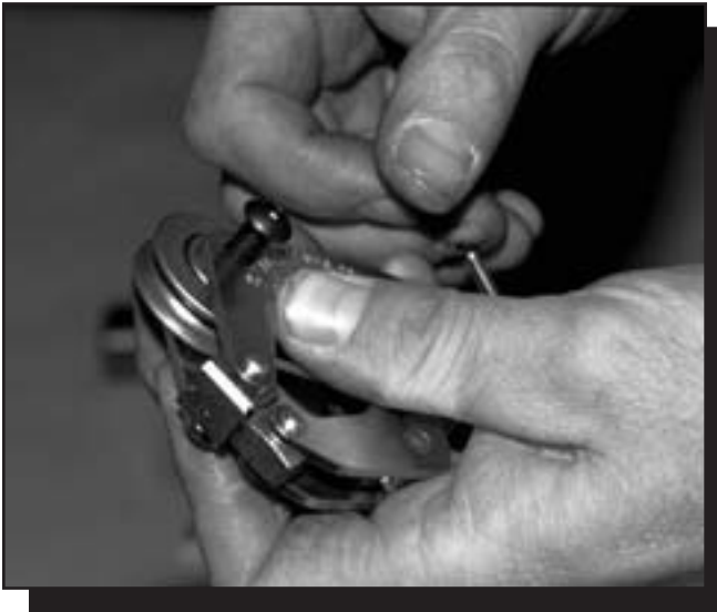
Figure 11—Push the button-head cap screw through the drilled holes.