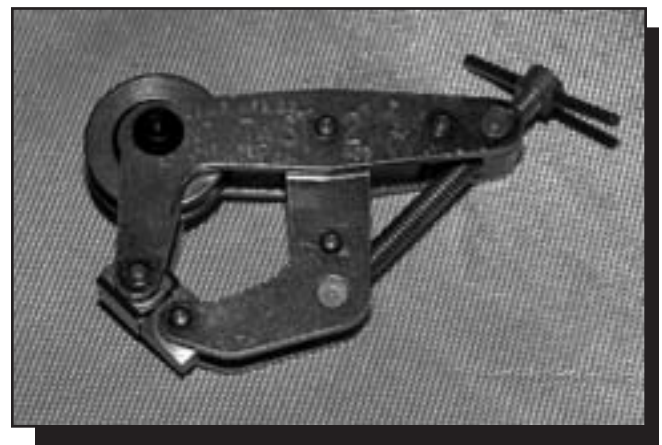
Figure 2—The underbuck, which attaches to the ax handle, features a 2-inch clamp with a shielded steel pulley.