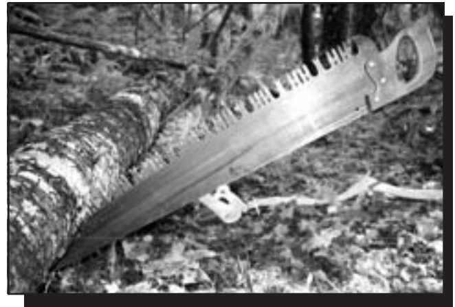
Figure 1—The underbuck supports the back of the crosscut saw and provides leverage for making cuts from the bottom of a log.

The parts were purchased from Reid Tool Supply Co.; P.O. Box 179; Muskegon, MI 49443; Phone: 800-253-0421.