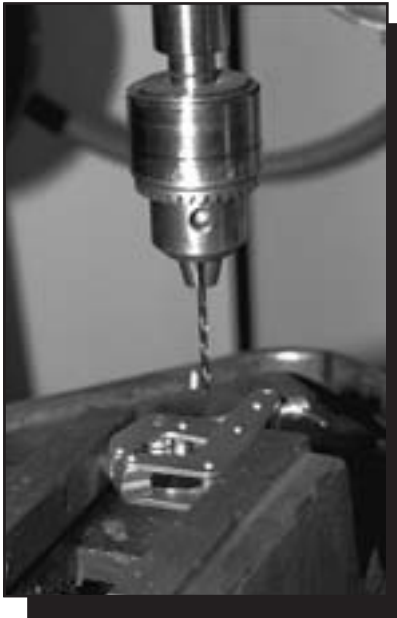
Figure 7—Using a \frac{1}{8} -inch drill bit, drill into the clamp pin to a depth of \frac{1}{4} inch. Turn the clamp over, secure it in the vise, and repeat the process. This provides a guide hole for the next step.