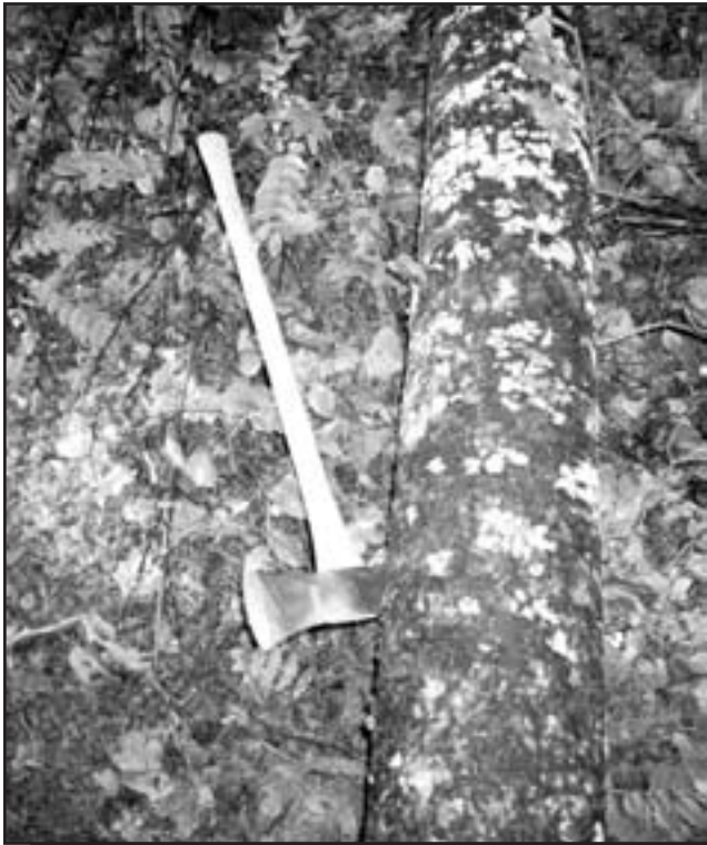
Figure 14—Insert the blade of the ax parallel to the log with the handle between 30 and 45 degrees to the log.