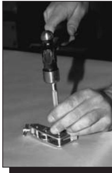
Figure 5—Center punch the clamp pin on both sides.