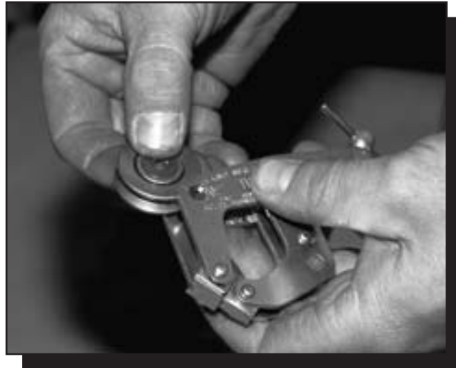
Figure 10—Insert the steel pulley and the two disc springs between the side plates of the clamp.