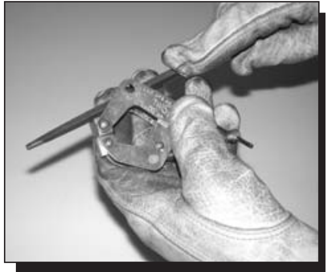
Figure 9—File all rough edges of the drilled holes smooth with a metal file.