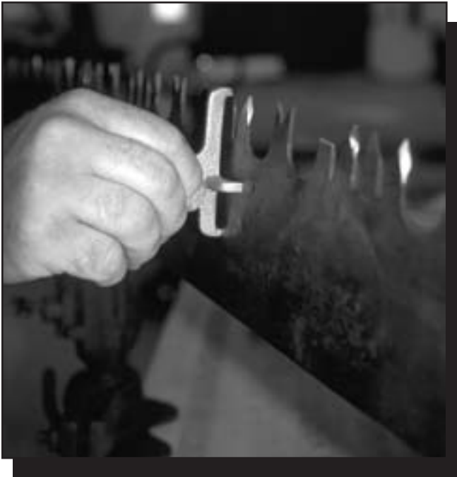
Figure 2—A spider gauge measuring the set of cutting teeth on a crosscut saw.