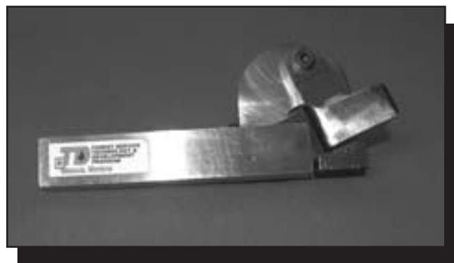
Figure 1—A crosscut saw tooth-setting tool. A hammer is used to bend the tooth against the anvil.

flat ground, meaning the blade's thickness does not vary. A taper-ground saw requires less set than a flat-ground saw. For example, a taper-ground saw cutting dry hardwood requires very little set in the cutting teeth. The same saw cutting soft or rotten wood could require a set of up to 0.030 inch. A tooth set of 0.010 inch is a good place to start. The typical tooth set for most Forest Service applications is in the 0.012- to 0.015-inch range.