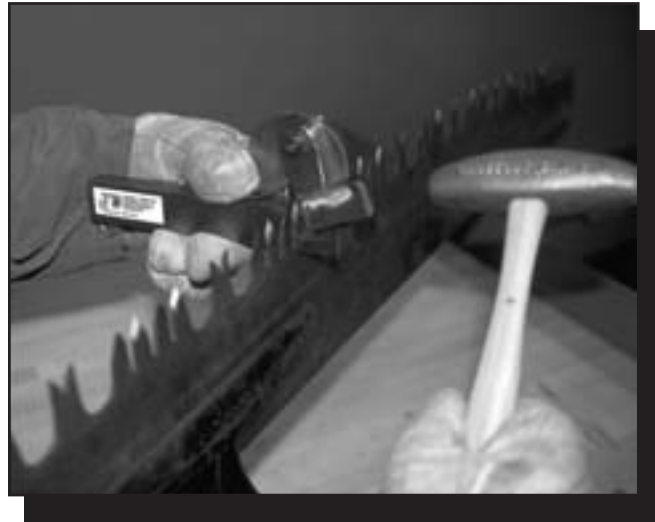
Figure 4—Setting the tooth with the crosscut saw tooth-setting tool.

Keep the face of the anvil parallel to the plane of the saw when setting the tooth. If the anvil is held at an angle, the tooth could be twisted when set. Use a spider or a dial indicator gauge to check the set of the tooth. If you are using a spider and its vertical legs rock, there is insufficient set and the tooth should be worked again. If the horizontal leg rocks, there is too much set and some must be taken out. The backside of the tool can be used as a hand anvil to remove set. To do so, place the cutting tooth close to the top of the anvil and strike the tooth with light blows until the set is correct.