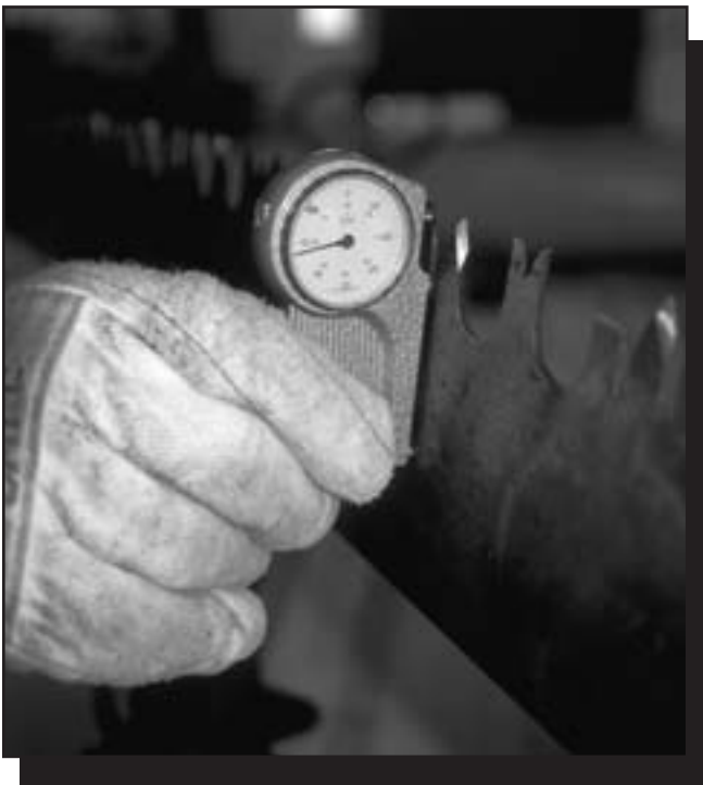
Figure 3—A dial indicator gauge measuring the set of cutting teeth on a crosscut saw.