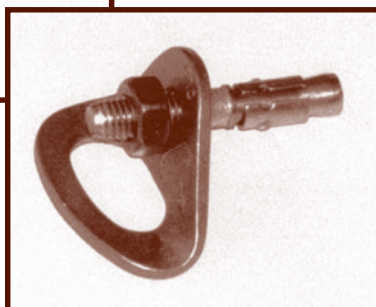
Figure 2—An expansion bolt is used with a nut to attach a hanger.

Sport climbing evolved through technological advances in climbing equipment. This type of climbing is usually done on a single pitch, or face, and often relies on bolts. Sport climbing differs from traditional rock climbing where more strategic, and sometimes horizontal, movement is favored over a quick vertical climb and descent. Bolted routes increase the margin of safety for climbers.