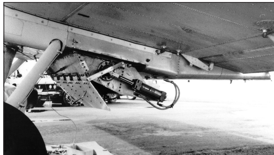
Figure 1—View of the gate of the Marsh Turbo Thrush.

Flow rate, drop height, and air speed all have an effect on the drop pattern. Since this type of airtanker is normally used over a narrow range of height and speeds, only the effect of flow rate is considered here. Figures 2, 3, and 4 show the drop patterns resulting from flow rates produced by using the 40-