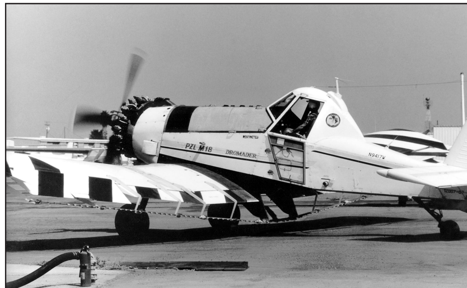
Figure 1—The Western Pilot Services Dromader.

Flow rate, drop height, and airspeed all have an effect on the drop pattern. Since this type of airtanker is normally used over a narrow range of heights and speeds and because each gating system produces a single flow rate, information about an average drop is presented (Figures 2 and 3).