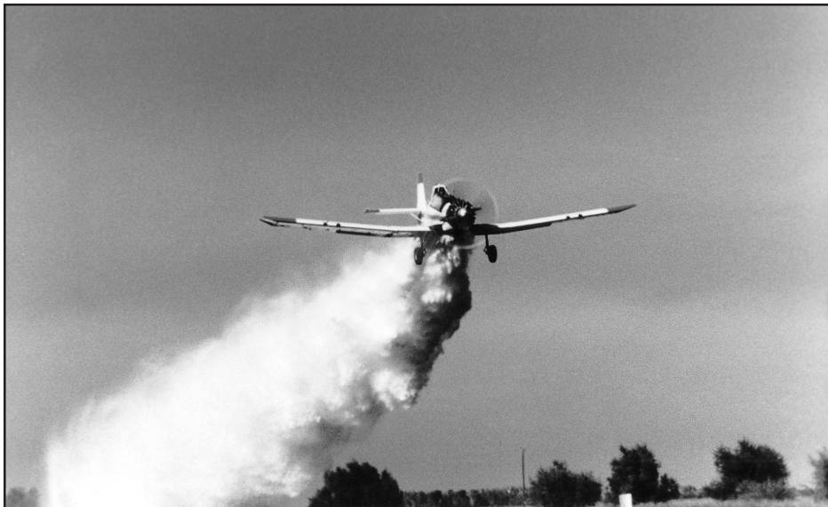
Figure 4 – Drop test of the Western Pilot Services Dromader.