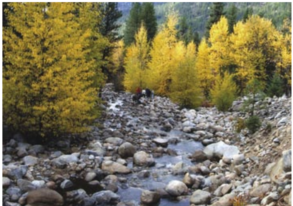
Figure A5—Twenty-mile creek was channelized near the top of the alluvial fan. Note levee at right of photo.

The original structure in the main fan channel was an 8-foot culvert that was washed downstream in a 1972 flood. At that time, the fan was functioning normally, and bedload and debris deposition at the fanhead frequently caused the main flow to shift location, such that the crossing was at times useless. After the washout, the main channel was straightened and leveed to avoid overflows and to fix the channel in place (figure A5), and the crossing was replaced with a vented ford. The channel modification increased water velocity and the pipe on the ford plugged (figure A6) causing water to divert down the road (figure A7). The modification also impaired the natural water and sediment storage functions of the fan, causing more rapid water and sediment delivery to the Chewuch River during floods. This contributed to a reduction in water quality and, possibly, quantity during low summer flow, which is critical for downstream irrigation and fish habitat.