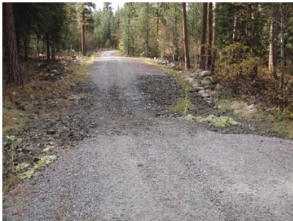
Figure A4. Hardened rock ford on East Chewuch Road.

The Twenty-mile Creek alluvial fan is a very active depositional zone at the edge of the main Chewuch River valley. In addition to the main channel descending the fan, there are several distributary channels, which are expected to move around frequently. The East Chewuch Road crosses all these channels on the lower part of the fan. The hardened rock fords on distributary channels are inexpensive, low maintenance, and easy to replace if the channels do move. These channels lead to spawning habitat for steelhead at the fan head, and fish have been observed successfully passing on their way upstream. The fords approximate natural channel size and shape and have not required major maintenance since construction in 1999. An old concrete vented ford, believed to block adult steelhead, crosses the main channel.