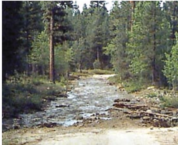
Figure A7—Plugged culvert causes water diversion down road before construction of rock fords.