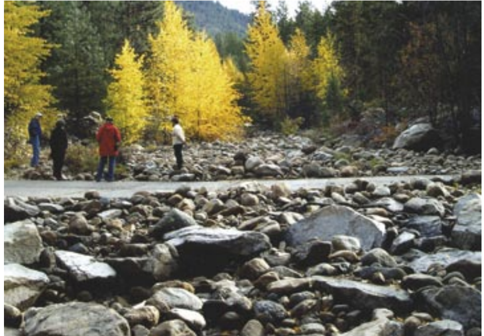
Figure A6—Vented ford plugged with boulders.

To reduce sediment input to the Chewuch, and to increase water storage on the fan, the district in cooperation with the Pacific Watershed Institute undertook a channel restoration project in 1999. The levees were breached, and flow was allowed to disperse into several distributary channels down the fan, more closely simulating natural flow patterns. To permit fish passage up the secondary channels, culverts were replaced with the hardened fords described here.