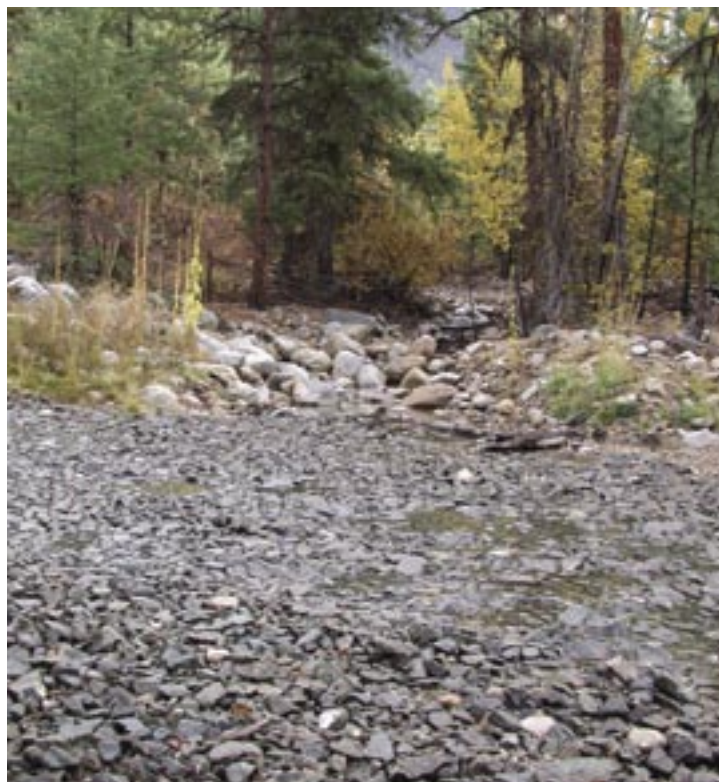
Figure A8—Looking upstream along a distributary channel (hardened dip in foreground).

Aquatic Organisms: Two Upper Columbia Basin endangered species—spring chinook salmon and steelhead trout—as well as redband trout (a sensitive species) use this stream for spawning and juvenile rearing. Resident bulltrout (threatened), west slope cutthroat, and redband are thought to use 20-mile Creek for foraging.