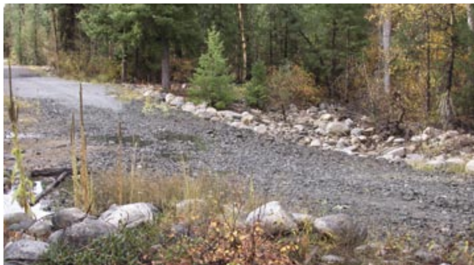
Figure A10. Hardened dip on East Chewuch Road.

The structures were built in 1999. They have not experienced a major event and maintenance has been limited to minor reshaping of the approaches. No sediment has required clearing from the roadway. Fish are spawning in the ford, which means the road must remain closed for longer periods in the spring (2 to 3 months).