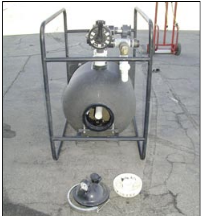
Figures 9a and 9b—Sand filter module.