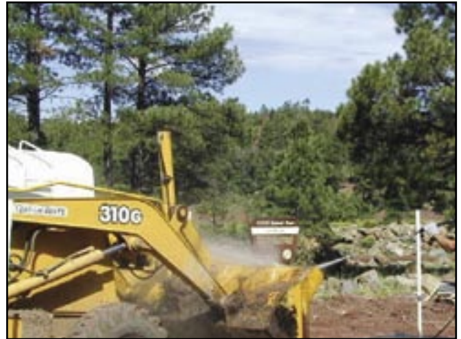
Figure 12—Loader at Dogtown Lake.

and pumped it into a holding tank, where it was later settled, filtered, and disposed of in a sanitary sewer. Sludge was shoveled off the containment mat and onto a tarp to dry. The entire operation only used 75 gal of water, so recycling was neither necessary nor practical. The Dogtown Lake project is a good example of a situation requiring minimal hardware, most of which could have been rented. Hiring a service contractor to bring a washing station to the jobsite and wait until the equipment was ready to wash would have cost more than $5,000.