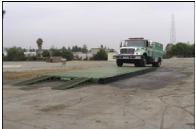
Figure 2—Elevated washrack.

At least two domestic manufacturers build portable elevated washracks (figure 2). One company builds washrack panels in 10-, 12-, and 14-foot widths. The 8-foot-long panels are placed side by side to the desired length. They are designed to carry axle loads of 12 tons, and need support on just two sides. Another company offers a similar modular washrack with 6- by 8-foot panels designed to handle 15,000-pound wheel loads. Both systems can handle wheeled or tracked equipment, and the runoff is collected in the center or in a gutter alongside. Raised panels make it easier to wash the underbody.