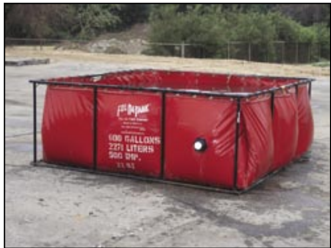
Figure 5—Folding tank.

Lightweight polyethylene tanks are available in many sizes and configurations. They can serve as supply, treatment, or settling tanks, but are bulky. Costs range from $350 for a 200-gallon tank to $700 for a 500-gallon tank. Larger sizes are available for permanent installations. Some opaque polyethylene tanks are designed specifically for water storage. They block sunlight and minimize the potential for algae growth .