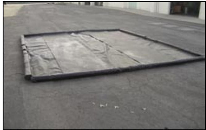
Figure 1—Flexible mat.

Flexible mats come in many sizes and styles (figure 1). They serve as portable berm systems to contain washwater and debris. They are a durable, chemical-resistant rubber material. Some models have berms that are permanently attached to the perimeter, while others have removable inserts. Permanent berms on flexible mats can make storage difficult. One plain rubberized mat has polyvinyl chloride sewer pipe tucked under the sides with foam cushions under the approach and departure ends. Lay geotextile or similar cloth underneath to prevent sharp rocks from penetrating the mat. The plain mat rolls or folds up for handling and storing.