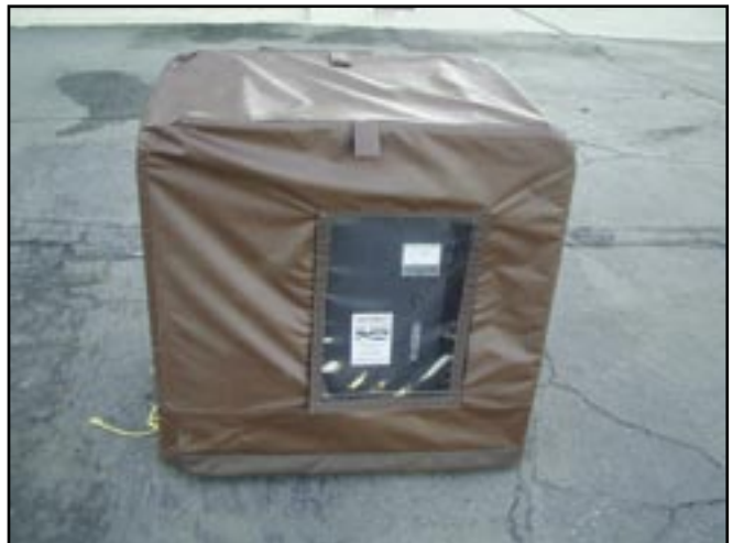
Figure 11—Ozone generator module.

SDTDC built the portable ozone generator module in figure 11 for field use. It combines a corona discharge ozone generator, desiccant air dryer, regulator, and buffer tank. The supply air is processed through the dryer at 100 psi and then reduced to 5 psi before the generator. Desiccant dryers work more efficiently at high pressures and the generator requires clean, dry air. This ozone generator; however, cannot handle pressures above 10 psi, so a regulator was placed downstream of the dryer. SDTDC staff customized a cover to protect the unit from overspray or rain while