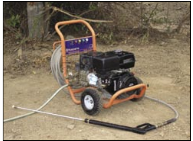
Figure 3—High-pressure washer.

Many household and industrial pressure washers have outputs of up to 4,000 psi. Flows generally range from 2 to 5 gal/min and with attachments, these high-energy spraying systems can remove the most tenacious debris. Models are available at home improvement stores. The low-water consumption reduces supply water and wastewater needs. However, these high-pressure sprayers produce large amounts of debris scatter and overspray. Use caution to prevent sensitive component damage. Wear personal protective equipment and use caution to avoid injection injuries and other flesh wounds.