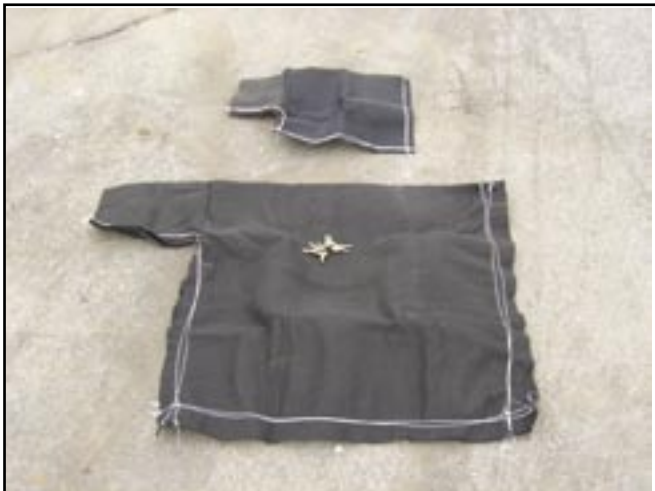
Figure 8.—Geotextile bag.

Another option for filtering larger solids is to specify a bag with larger openings. A 500-micron bag captures medium and large sand particles plus other large debris. Fine clays and ash pass freely without bridging. SDTDC experimented with small, custom-made 500-micron geotextile bags on a sump return. The bags measured 16 in 2 , with an inlet spout sewn on one corner. The bags were effective, durable, and manageable when filled with 40 pounds of wet sand and solids. The bags can be reused if a disposal container is available for the waste material.