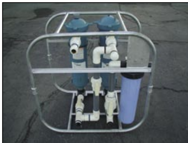
Figures 7a and 7b—Bag and canister filter modules.

Bag filters are two-dimensional surface filters and the bag membrane area determines how quickly it clogs. If bag material and micron rating are equal, an X01 bag with a 63-square inch ( in^2 ) area only passes 60 gal of water before clogging, while a #2 bag with 101 in^2 area clogs after passing 96 gallons of the same water. Filter bags can be rinsed and reused.