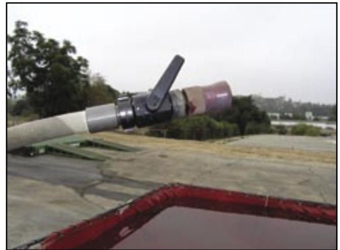
Figure 4—Barrel nozzle with shutoff.

The 1-inch combination barrel nozzle (combi) commonly used for firefighting is particularly effective for equipment washing. It uses 13 gal/min at 50 psi when adjusted for a narrow cone spray pattern. A 1-inch ball shutoff ahead of the nozzle minimizes spray pattern adjustments and enables instant shutoff. The long spray range and low-pressure coverage minimizes injury. The combi requires a high-water volume compared to other high-pressure washing systems.