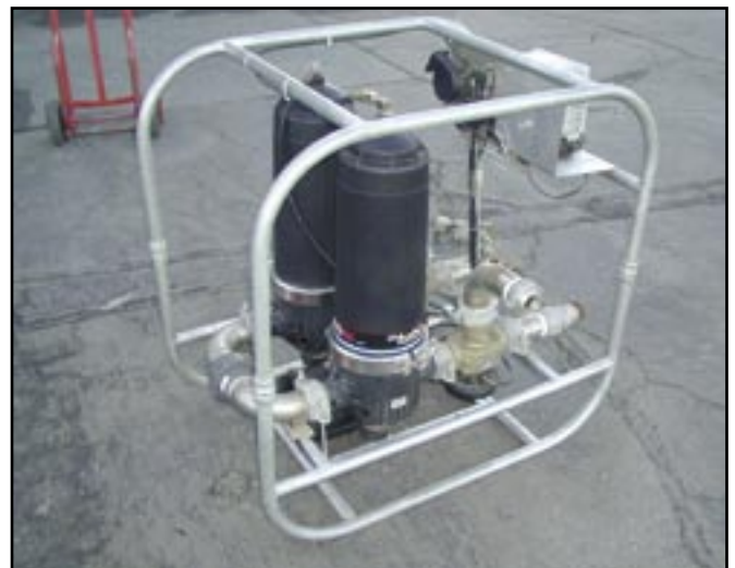
Figures 10a and b—Disk filter module.