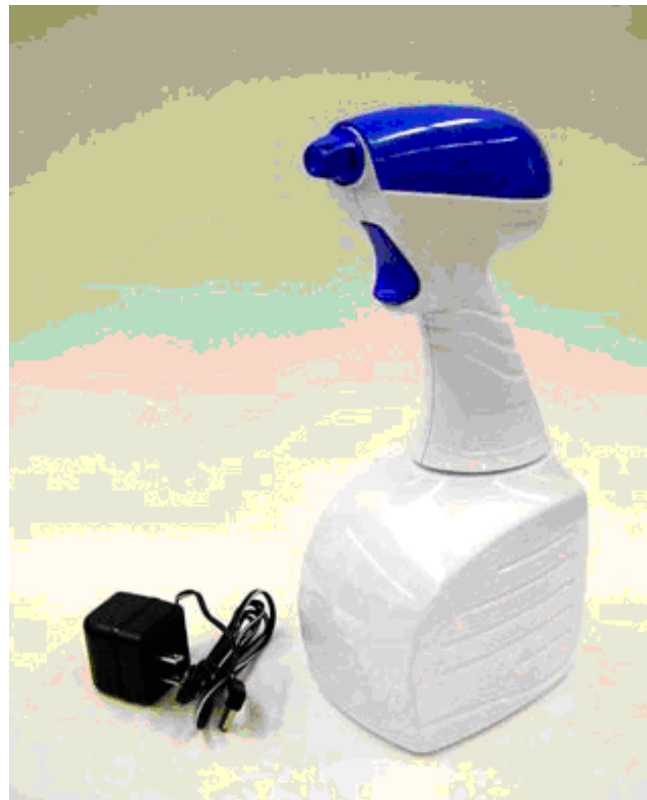
Figure 3. Handheld model (one-hand carry and operation).

Saint-Gobain Calmar PS2001. This model is under development by the company.