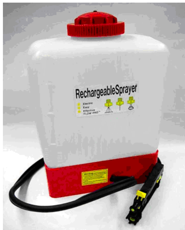
Figure 1. Backpack sprayer.

and are wheeled. The available sprayers are made of plastic and designed for light duty home and garden use. They may not be appropriate for extended field use. They probably would not withstand rugged field applications. If the sprayer systems can handle paint, then the rechargeable battery and pump system may be able to be adapted to the backpack sprayer units currently in use. Evaluation was limited to units of a size that would be portable in the woods. This would keep the weight at a reasonable range for carrying for extended periods in the field.