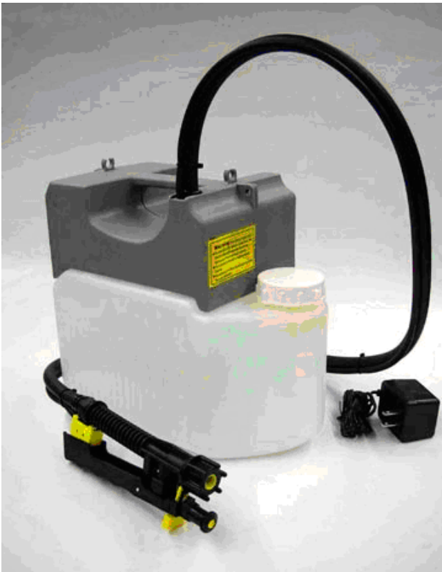
Figure 2. Hand-carry model.

Flow Pro Model 417. This model has the following characteristics: