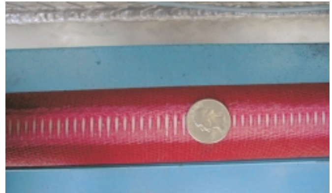
Figure 3—Closeup of an abrasion test sample for DRAFTEX® hose.

Performance data for semirigid rubber-braided, wire-reinforced; DRAFTEX®; and REELTEX® draft hose is shown in table 4.