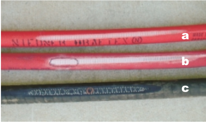
Figure 2—Abrasion test samples for (a) DRAFTEX®, (b) REELTEX®, and (c) semirigid rubber-braided, wire-reinforced draft hose.

Abrasion resistance testing was conducted using the Factory Mutual (FM) abrasion test machine and test method (figure 2). Abrasion testing was held after 40,000 cycles without failure, as was noted with the DRAFTEX® hose (figure 3).