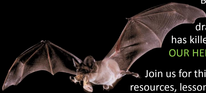
Brazilian Free-tailed bat

Bats are in decline nearly everywhere they are found. Bats in the U.S. and Canada have declined dramatically as a new disease, White-Nose Syndrome, has killed over 6 million bats in just six years. BATS NEED OUR HELP!