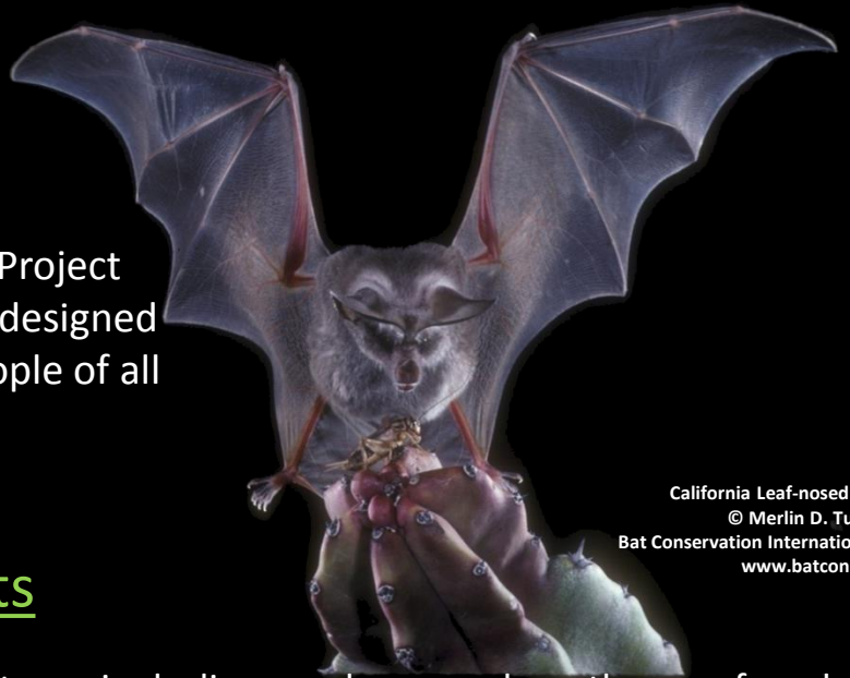
California Leaf-nosed Bat