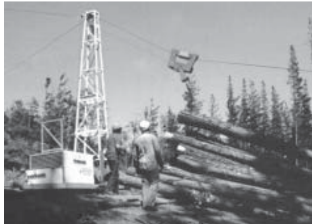
Koller K 300 Cable Yarder.

Status: In production Prime mover: Can be transported by ¾-ton truck (minimum), or 1-ton truck (preferred). Engine power: Three-point hitch tractor mounted 50-hp engine, minimum. Trailer mounted, 62 hp with hydrostatic drive Gas or diesel: Diesel