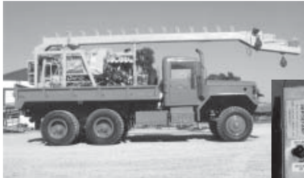
Clearwater Yarder and control panel (inset).

Purchase Price: Varies, depending upon your fabricator.