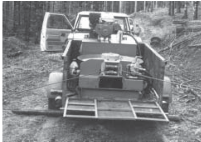
Miller Mono-Cable Yarder.

Purchase Price: Varies. Systems start around $18,000.