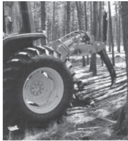
ImpleMax tractor-mounted grapple.

Status: In production Grapple type: 6042R/FG60: Category II 3-pt-hitch tractor grapple; 4836R/FG48: Category I 3-pt-hitch tractor grapple; 6042Rw/FG48w: Category I 3-pt-hitch tractor grapple/winch; 4836L: Loader-arm grapple; 4836Lw: Loader-arm grapple/winch Grapple capacity: 6042R/FG60/6042Rw/FG50w: 9.0-sq-ft enclosure area, 60-inch maximum opening width, 42-inch maximum opening height. 4836R/FG48/4836L/4836Lw: 6.94-sq-ft enclosure area, 48-inch maximum opening width, 36-inch maximum opening height