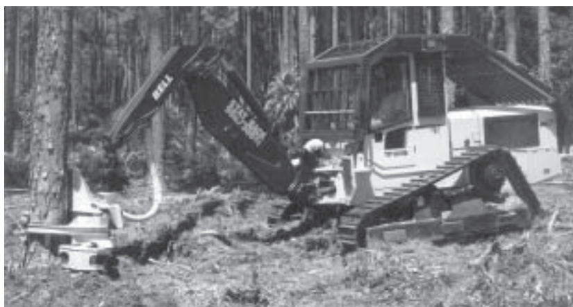
Bell Tracked Slewboom feller-buncher.

Status: In production Prime mover: TF 120 B is the prime mover. Engine power: 113 hp gross power, 106 hp net power Gas or diesel: Diesel Transmission: Hydrostatic Width: 89 inches Length: 14 ft 1 inch, without felling attachment