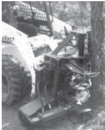
Big Red Little Mite tree cutter mounted on a skid steer.

Status: In production Prime mover: Designed to be mounted on farm tractors or front-end loaders/skid steers, with a minimum of 50 hp Cutting capacity: 12-inch softwood, 6-inch hardwood Note: For additional information, contact manufacturer directly.