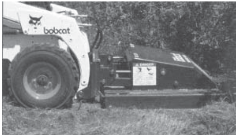
Brushcat rotary cutter made for the Bobcat.

Status: In production Prime mover: Bobcat 700- and 800-Series skid-steer loaders Cutting capacity: Brush material up to 3 inches in diameter