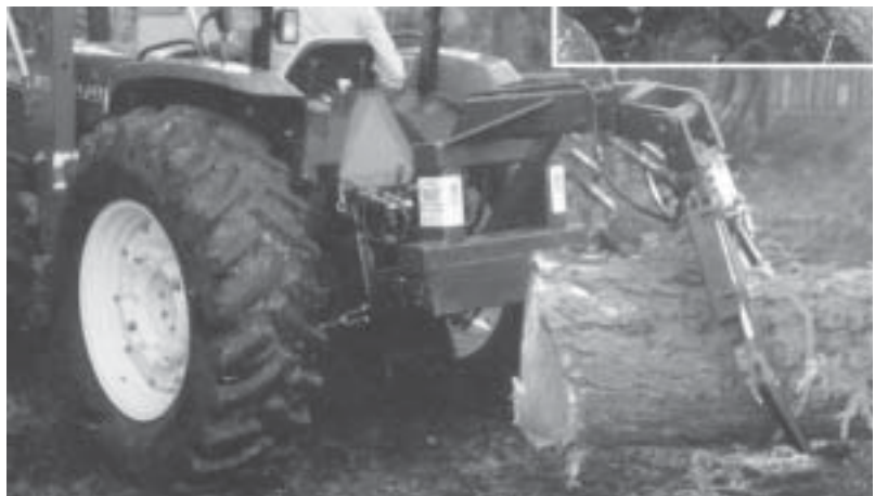
Little Red Logger tractor-mounted grapple.

Status: In production Prime mover: 50- to 80-hp tractors with a three-point hitch Length: 40 inches Weight: 750 lb