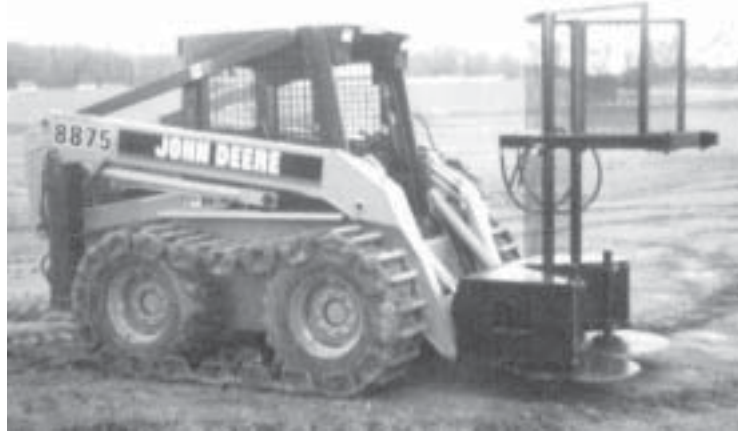
E-Z Shear Delite tree shear mounted on a skid steer.

Purchase Price: $2,995 for tree shear alone, and $3,995 for tree shear with accumulator