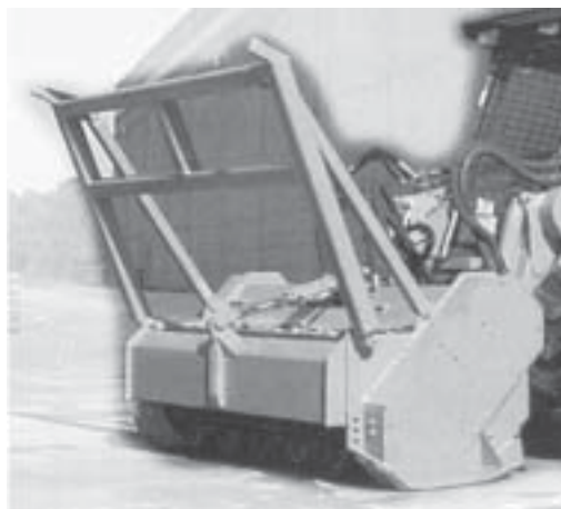
Bull Hog wood shredder.