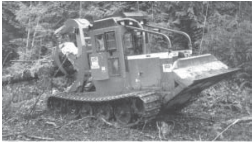
KMC 1000-series track skidder with arch grapple.

Purchase Price: From about $200,000 to $300,000 (U.S.). Price varies according to options.