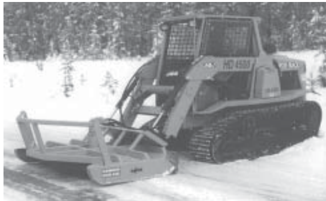
Davco BC 704 brush mower.

Purchase Price: From Davco, $6,800 (U.S.)