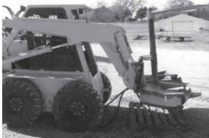
Agra Axe Li'l Snip tree shear mounted on a skid steer.