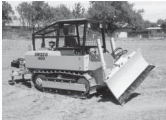
Sweco 480 trail dozer.

Status: In production Prime mover: Sweco 480 is a prime mover. Engine power: 80 hp Gas or diesel: Diesel Transmission: Hydrostatic Width: 4 ft Length: 11 ft 1 inch with blade and rippers Height: 6 ft 4 inches