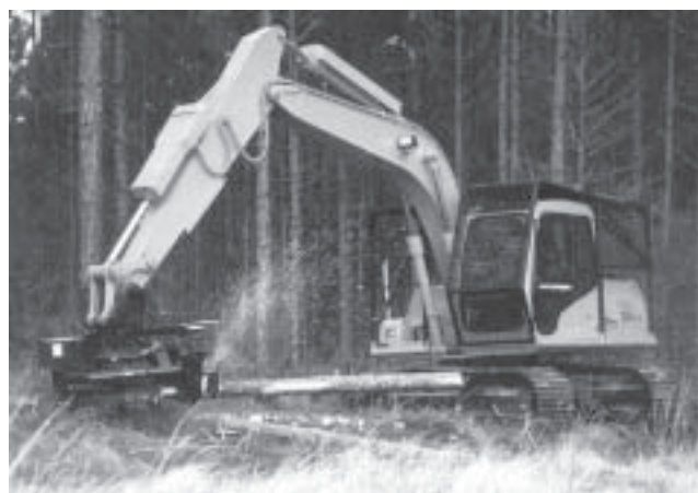
Hahn harvesting head mounted on an excavator.

Purchase Price: HSG-140: $49,805, and HSG-160: $53,275