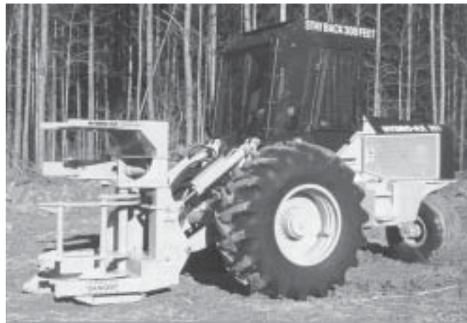
Hydro-Ax Tri-Wheel feller-buncher.

Status: In production Engine power: 116-hp Cummins Gas or diesel: Diesel Transmission: Hydrostatic Width: 112 inches with 23.1x26 tires Length: 215 inches Height: 119 inches Ground clearance: 20 inches Weight: 20,150 lb with thinning shear Ground pressure: Not available Wheels: 20x26 drive wheels; 23.1x26 tire