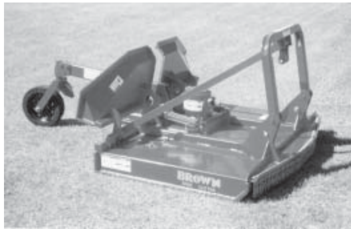
Brown tree cutter, Model TCF 2620.

Purchase Price: TCO-2515, $4,200; TCO-2615, $4,380; TCO-2620, $5,970; TCF-2615, $5,470; TCF-2620, $7,335