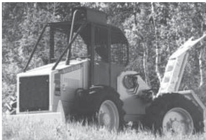
Turboforest TF-42C mini-skidder.

Canadian Purchase Prices: TF-42C Mini-Skidder (double drum): $80,000; TF-42C Mini-Skidder (grapple): $96,000