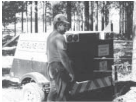
Howe-Line Mono-Cable Yarder.

Purchase Price: $25,000 (U.S., plus S&H)