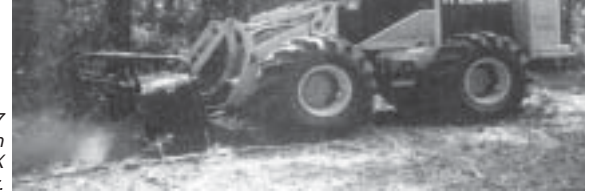
R.O.W. King T-7 mower mounted on a Hydro-Ax 411 EX feller-buncher.

Status: In production Cutting-head mechanism: Drum type Cutters: 5-ft drum has 38 teeth; 7-ft, 2-inch drum has 54 teeth Timing: The blades are arranged in four rows and are designed to be fully recovered in full extension and forward momentum on the next revolution. Cutting width: 5 ft or 7 ft 2 inches, depending upon head. Maximum cutting size: 15 inches