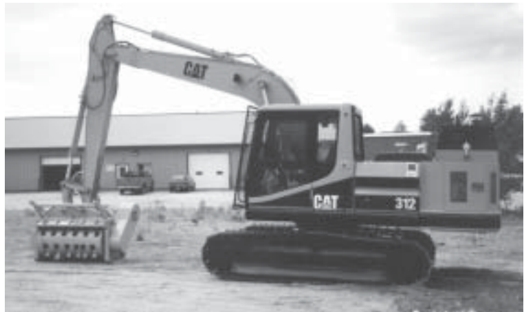
Brontosaurus shredder/brush-mowing head mounted on a CAT 312.

Purchase price: Standard 3- and 4-ft heads without auxiliary power pack, $26,500. With power pack, rock guards, and frame-strengthening, $72,500. 2.5 model, $22,500—power pack not available.