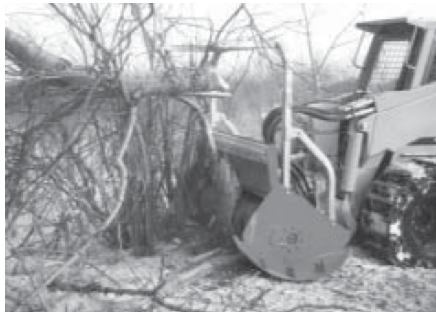
Seppi Midiforest mounted on a skid steer.