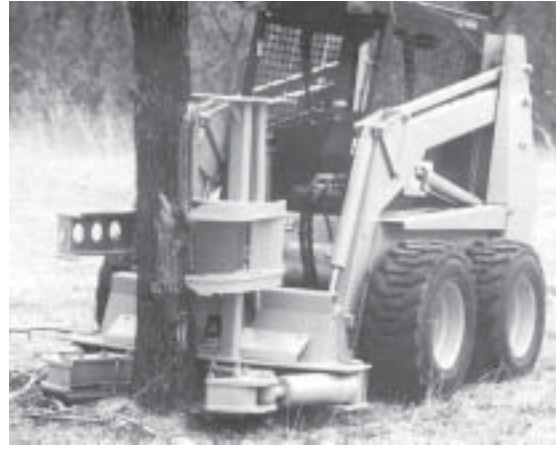
Dymax 14-inch forestry tree shear with accumulator, mounted on a skid steer.