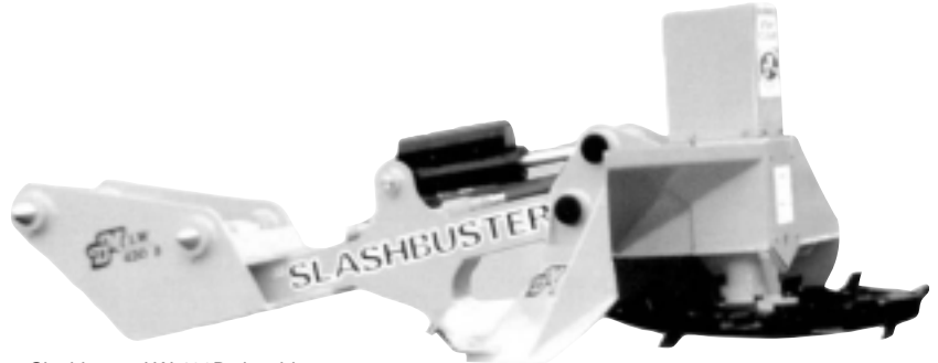
Slashbuster LW 420B shredder.

Status: In production Cutting mechanism: Hardened teeth on wheel Cutting width: HD 422: 46-inch cutting swath; LW 420B: 46-inch cutting swath Cutting capacity: Both models cut and mulch trees up to 14 inches in diameter. Weight: HD 422: 2,300 lb total weight. LW 420B: 2,600 lb total weight.