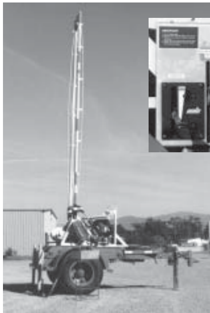
Bitterroot Mini Yarder and control panel (inset).

Purchase Price: Varies, depending upon your fabricator.