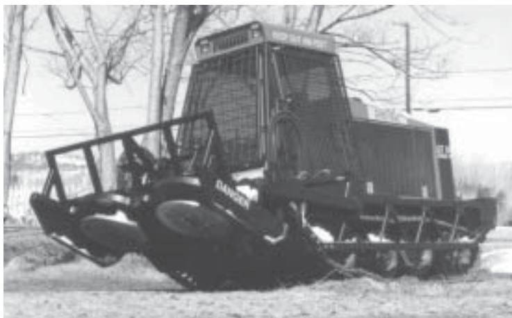
Gyro-Trac GT-18 Series II brush cutter (shown) has been replaced with the GT-18 XP.

Status: In production Prime mover: GT-18 XP brush cutter is a prime mover. Engine power: 180 or 190 hp Gas or diesel: Diesel Transmission: Hydrostatic Width: 100 inches Length: 229 inches Height: 113 inches