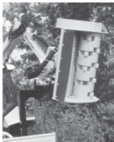
Alamo FM-Series tree shredder.